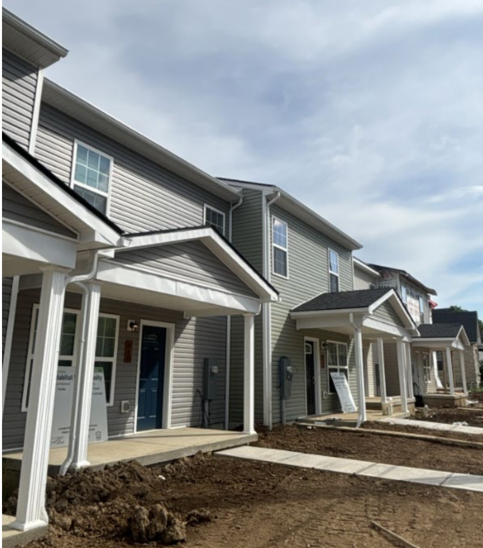
Lexington Habitat's current 7-connected townhome project at 7 th Street and Maple Avenue