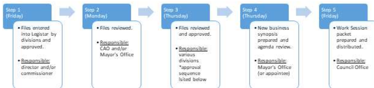
Figure 1. Administrative Work Flow