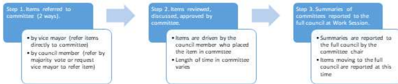
Figure 3. Required Business of Government Work Flow