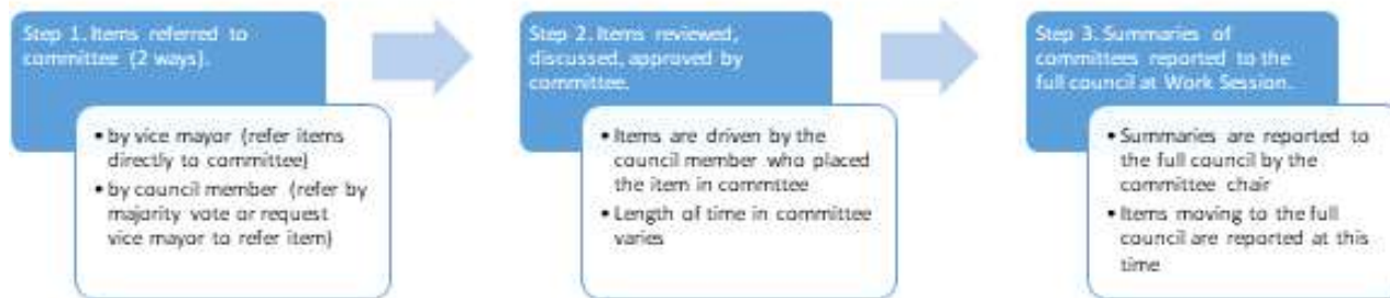
Figure 3. Required Business of Government Work Flow