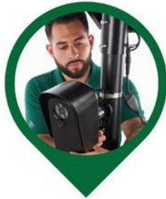
Field Operations Team

The Field Operations team is responsible for the physical installation and maintenance of cameras and associated equipment provided by Flock. This includes a large team of technicians, schedulers, and many others involved in ensuring the delivery of your product.