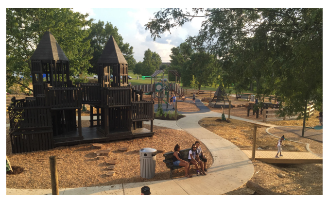
Jacobson Park Playground Renovation