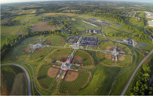
Elizabethtown Sports Park

Excellent site design has the greatest capacity to transform and create community by providing thoughtful, functional and beautiful places for us to live, play, interact and come to know each other.