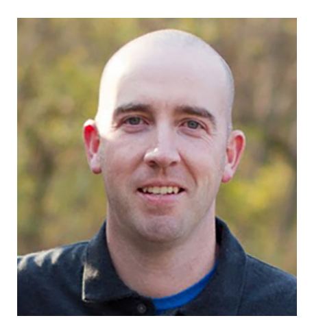
Registration: Kentucky, PE 26439