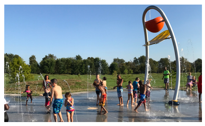
Masterson Station Park Sprayground