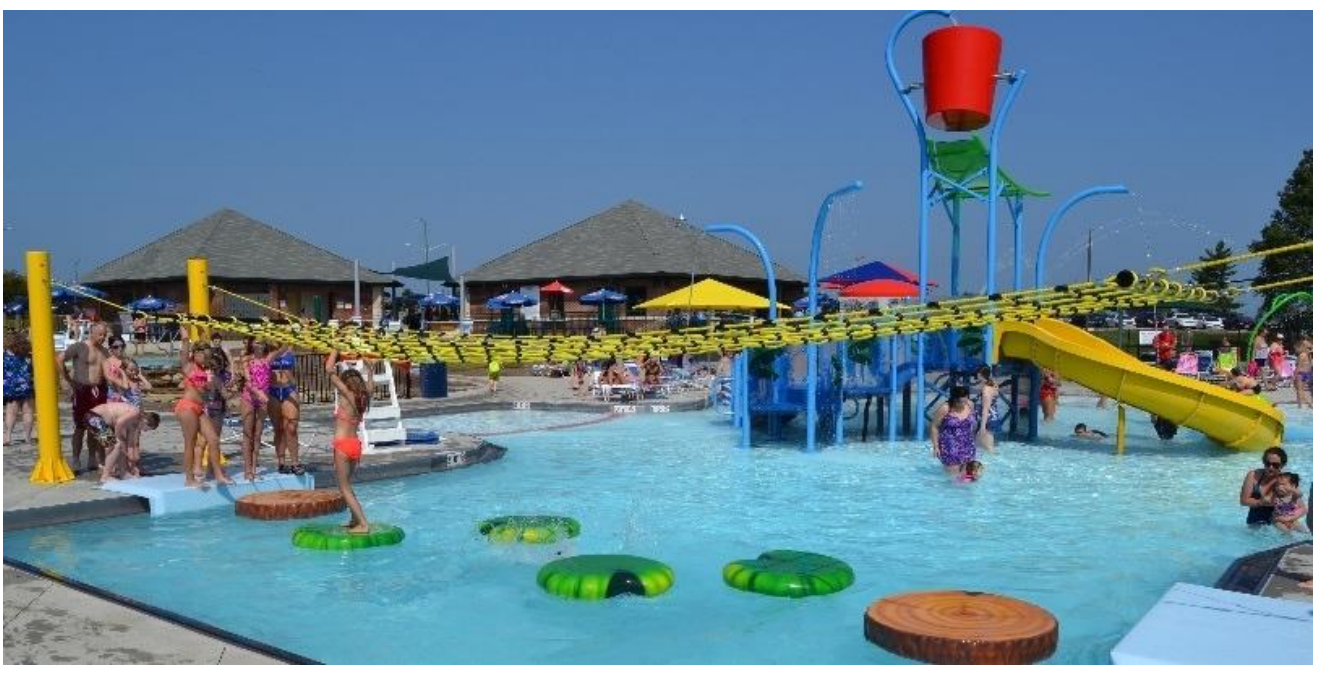
Regional Family Aquatic Center