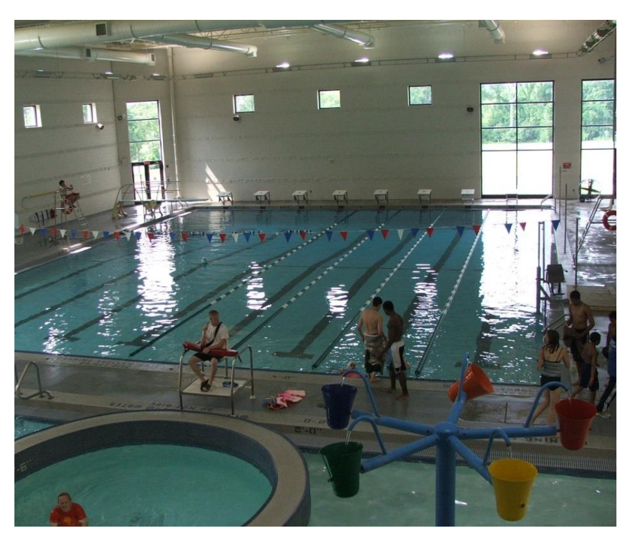
Indoor Family Aquatics Center- Georgetown, KY