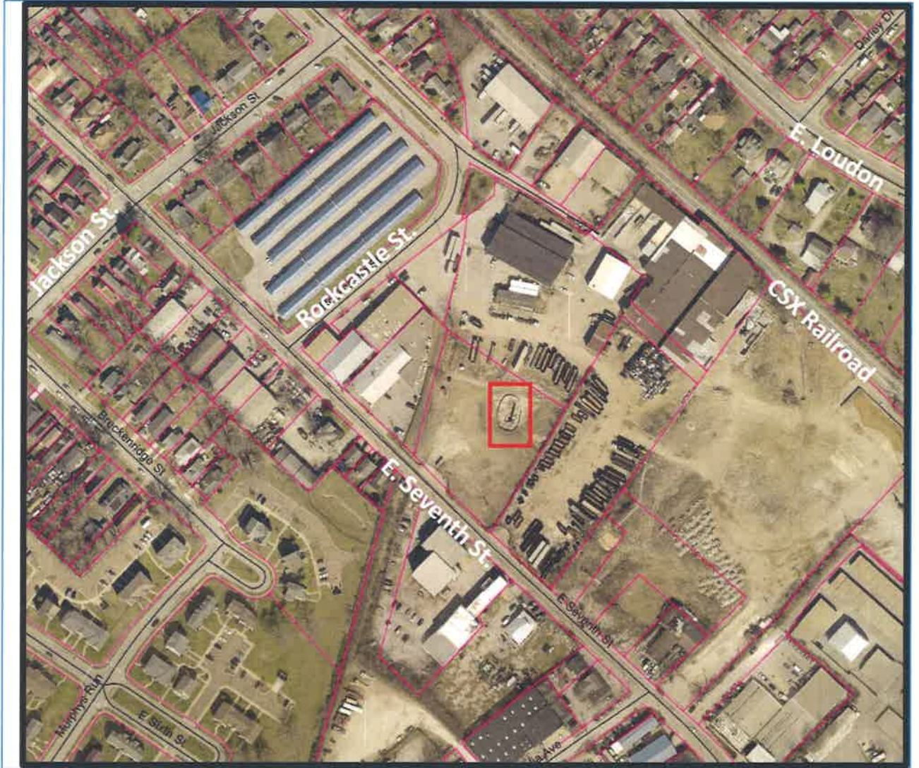
FIGURE 1 – MAP OF PROJECT AREA (FROM GOOGLE)

Note: The subject property is located within the Cane Run Watershed.