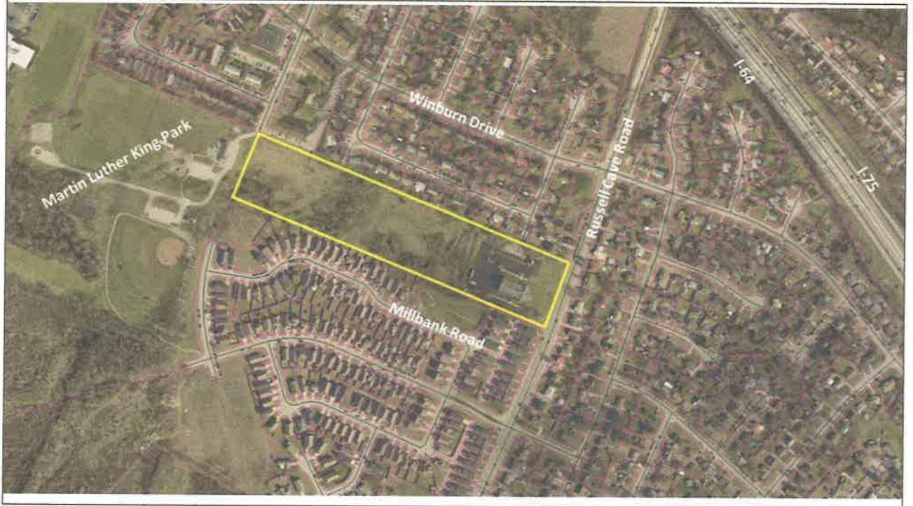
FIGURE 1 – MAP OF PROJECT AREA (FROM GIS)

Note: The subject property is located within the Cane Run Watershed.