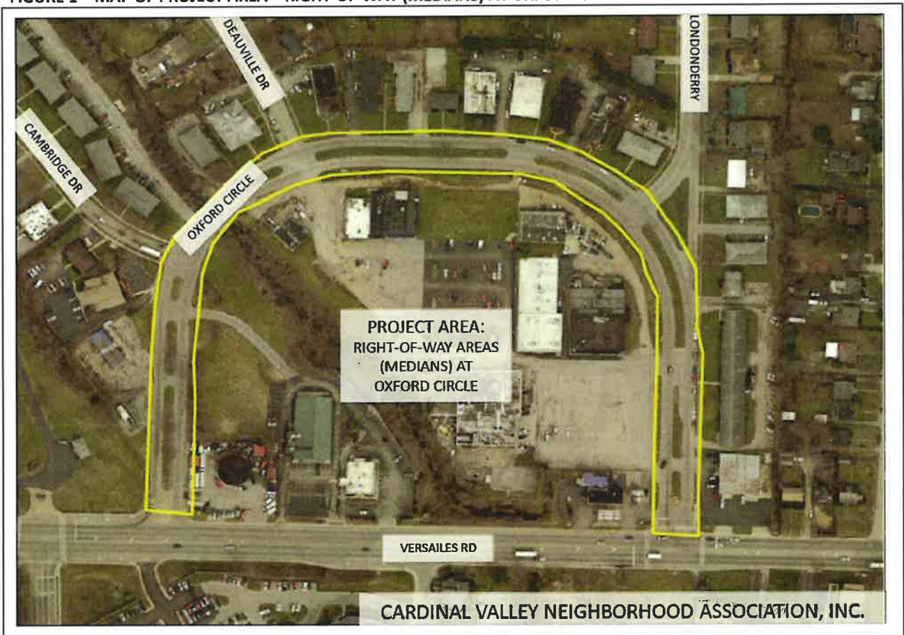
FIGURE 1 – MAP OF PROJECT AREA – RIGHT-OF-WAY (MEDIANS) AT OXFORD CIRCLE