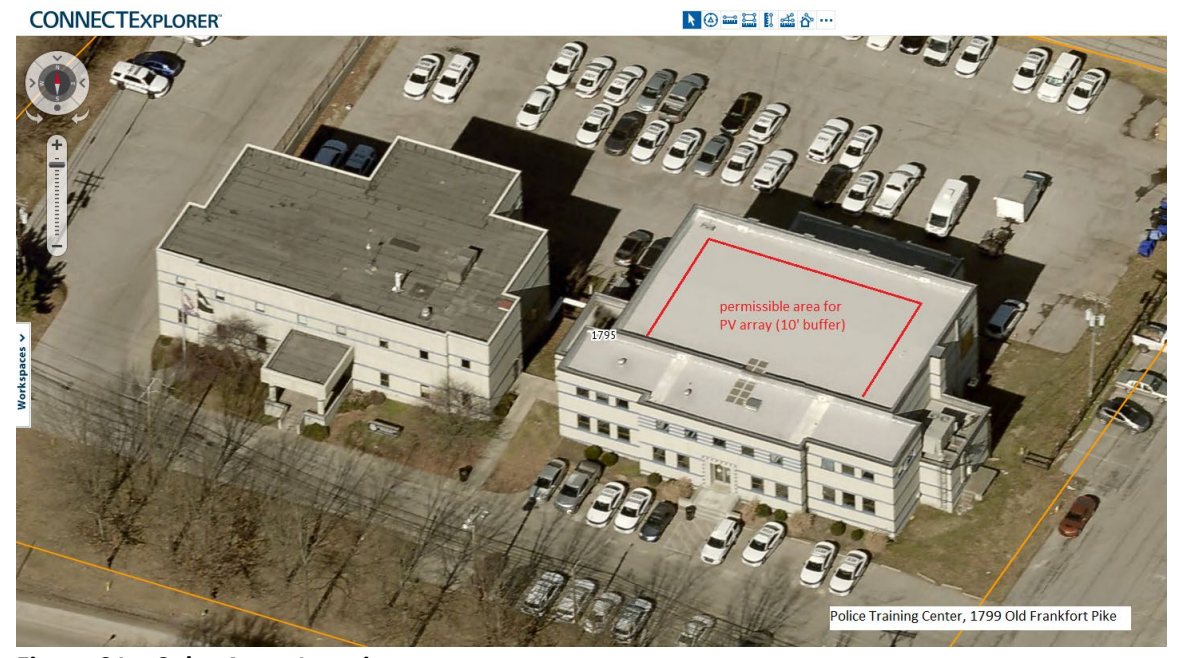
Figure 01 – Solar Array Location