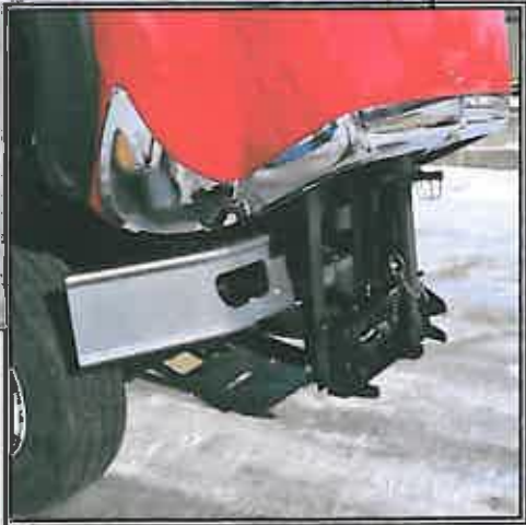
Shown with Quick Link Receiver, standard is 30-1/2" center push point.

Manufactured by Flink Company • 502 N. Vermillion St. • Streator, IL. 61364 A PROVEN LEADER IN ICE AND SNOW REMOVAL EQUIPMENT