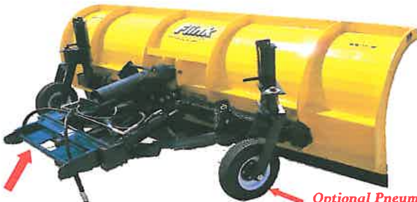
Optional QL2 Swivel Bar