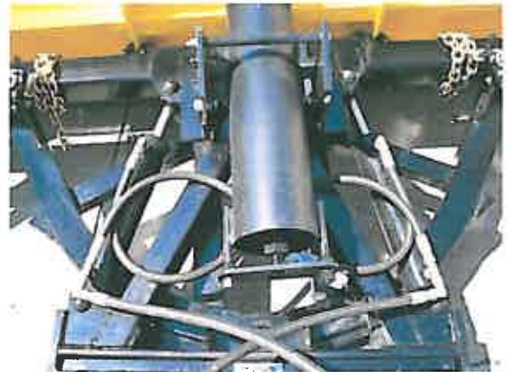
Optional 5"sq. HD Power Angle