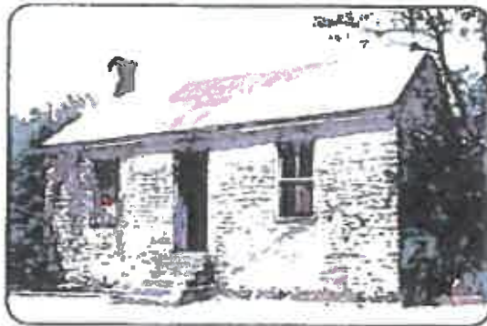
James McConnell House circa 1790