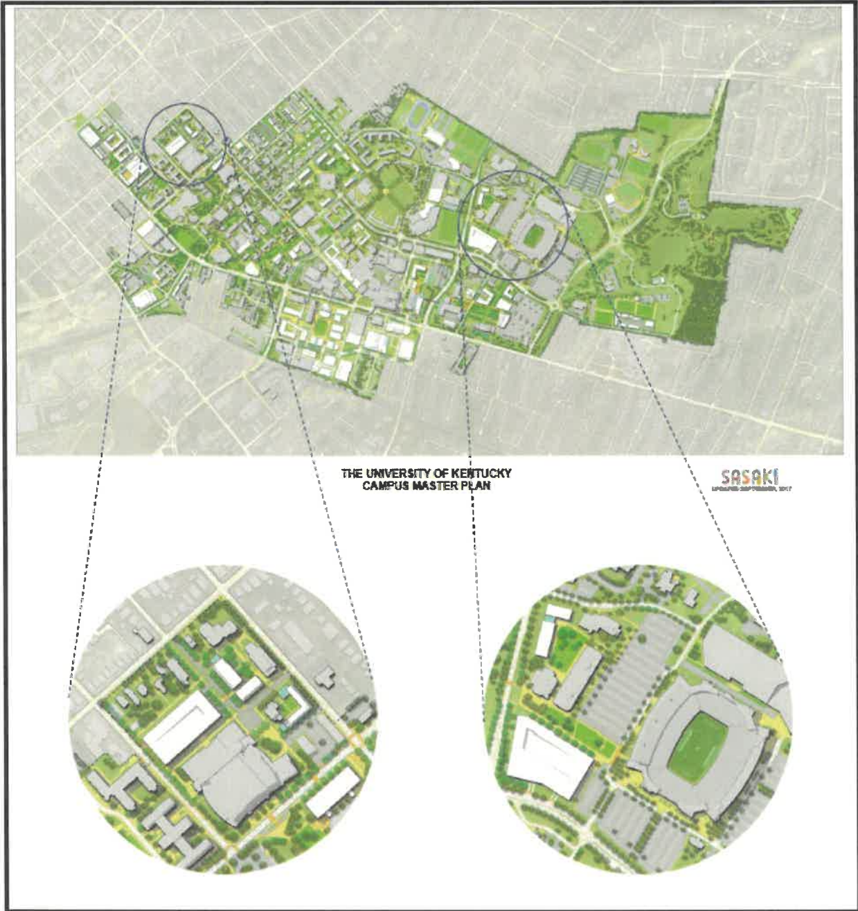
FIGURE 1 – MAP OF THE UNIVERSITY OF KENTUCKY CAMPUS MASTER PLAN (FROM APPLICATION)