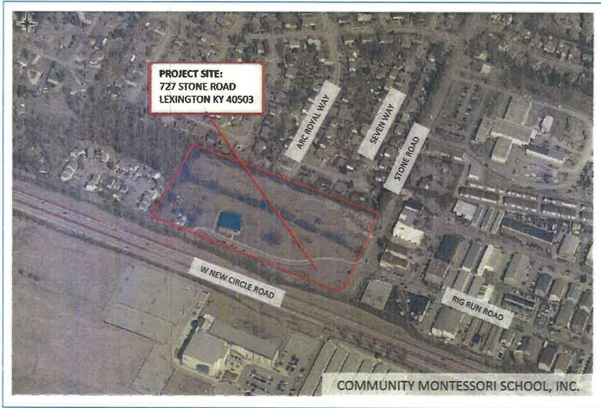
FIGURE 1 – MAP OF PROJECT AREA (FROM ARC GIS)