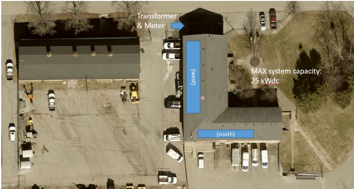
Figure 01 – Solar Array Locations