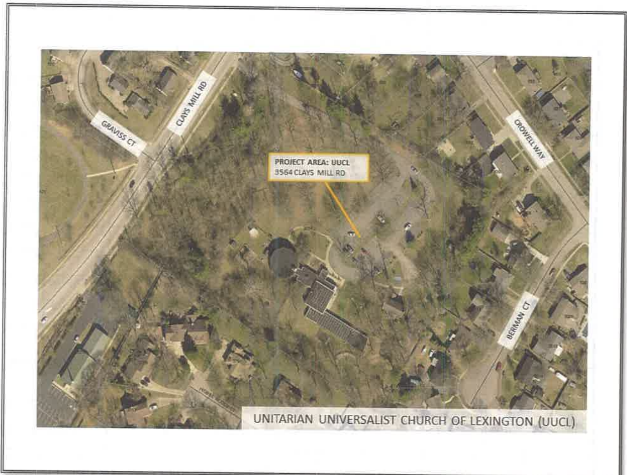
FIGURE 1 – MAP OF PROJECT AREA (FROM APPLICATION)