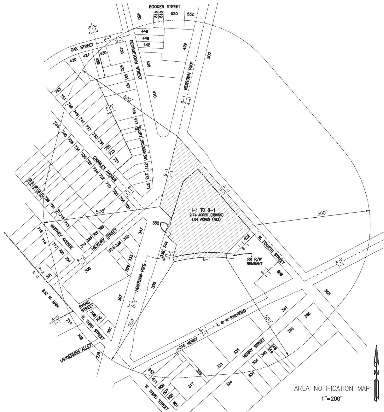
AREA NOTIFICATION MAP 1"=200'