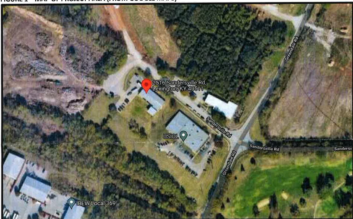
FIGURE 1 – MAP OF PROJECT AREA (FROM GOOGLE MAPS)