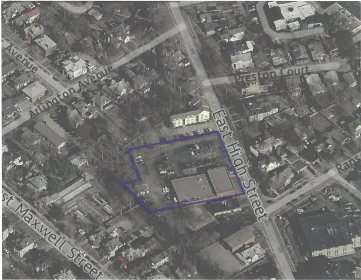
FIGURE 1 – MAP OF PROJECT AREA (FROM PVA)