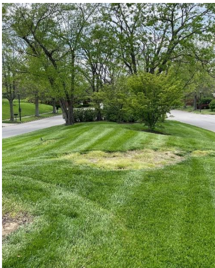
(LEFT) Wide medians on Hartland Parkway where non-native trees have passed offer fantastic future home sites for large majestic native oak trees.