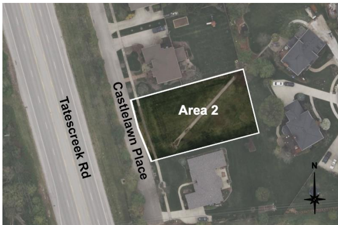
Area 2: Castle Lawn rainwater basin.

Landscape Architect Mark Yanik surveyed Hartland common areas to identify opportunities for growth and expansion of the tree canopy. The focal areas for planting include two HHA maintained rainwater basins, known as Area 2 (Castle Lawn) and Area 3 (Golden Oak).