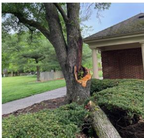
(Left) One of the diseased pear trees on the property that split during a spring storm in 2023.

Over the past year, Hartland experienced several large storms that severely impacted its tree canopy. These storms resulted in more than 50 trees being blown over, as well as dozens more with severed limbs; cleanup costs in 2023 exceeded $77,000. As our weather patterns become increasingly unpredictable and tumultuous, the tree canopy continues to be at risk.