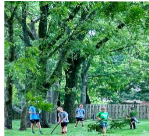
(Right) Our younger Hartland residents helping to clean up downed limbs.