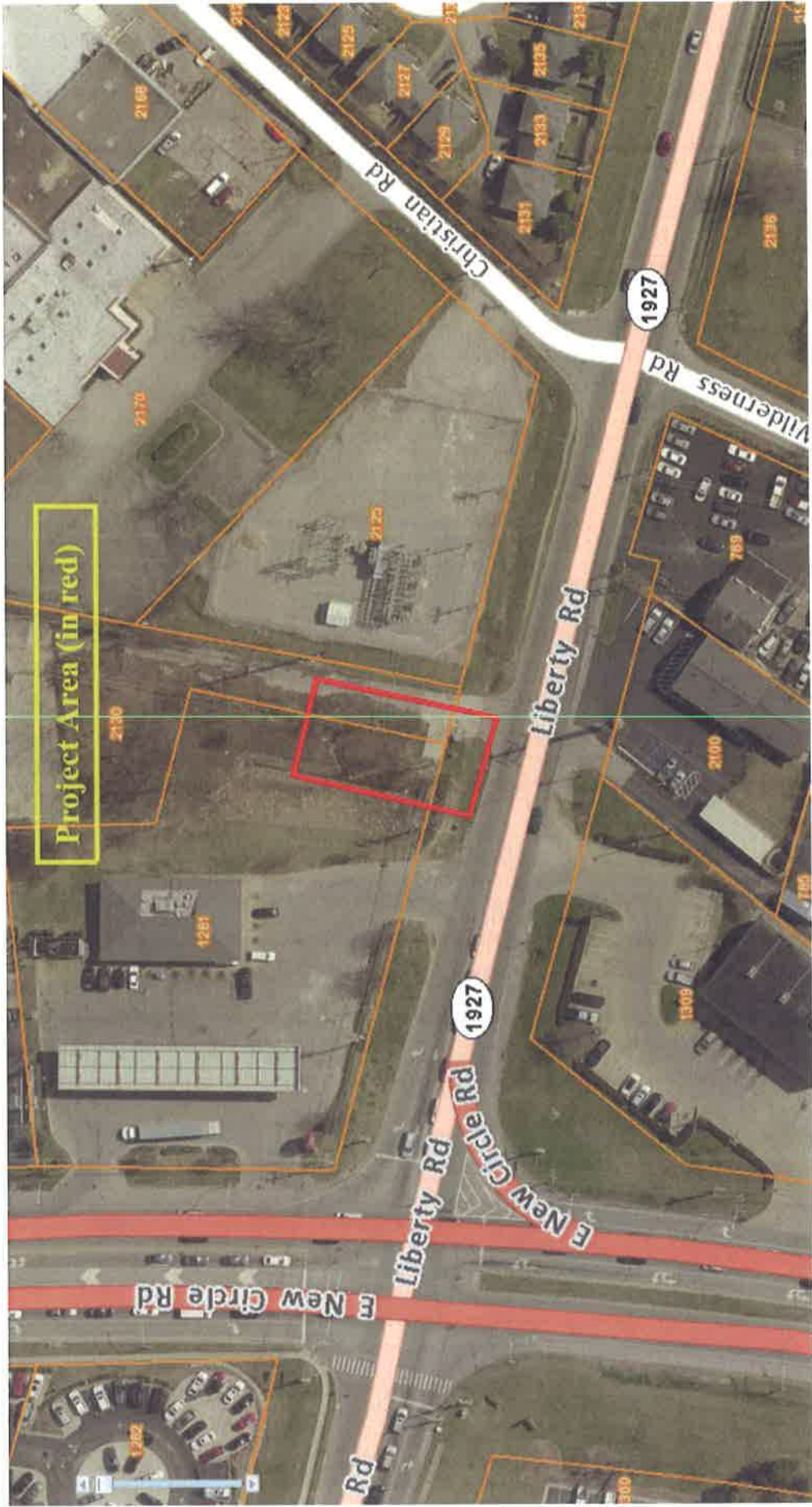
LIBERTY ROAD PUMP STATION REPLACEMENT – PROJECT AREA MAP