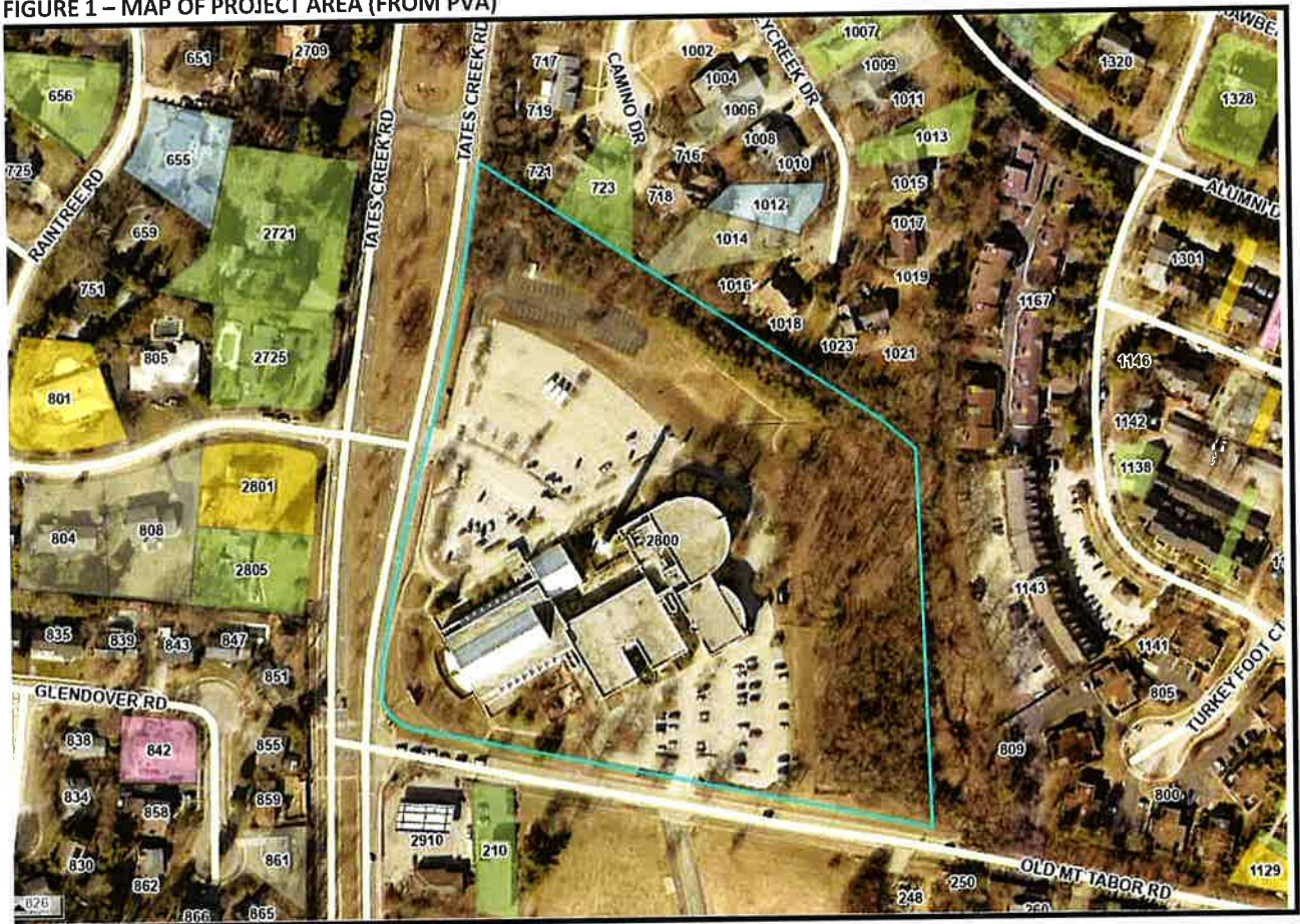
FIGURE 1 – MAP OF PROJECT AREA (FROM PVA)