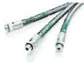
Wire Braid Hose, Couplings, and Assemblies