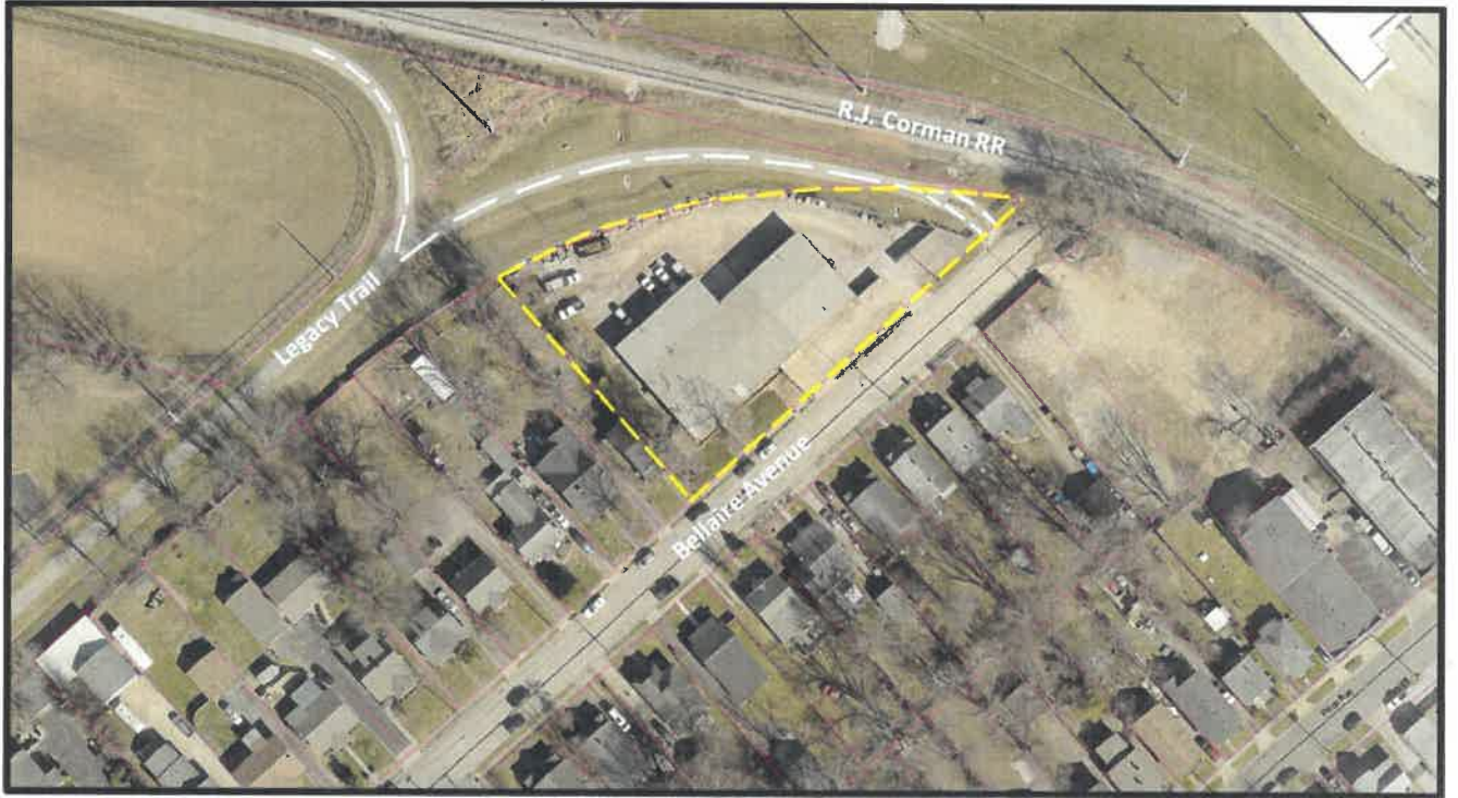
FIGURE 1 – MAP OF PROJECT AREA (FROM GIS)

Note: The subject property is located within the Cane Run Watershed.