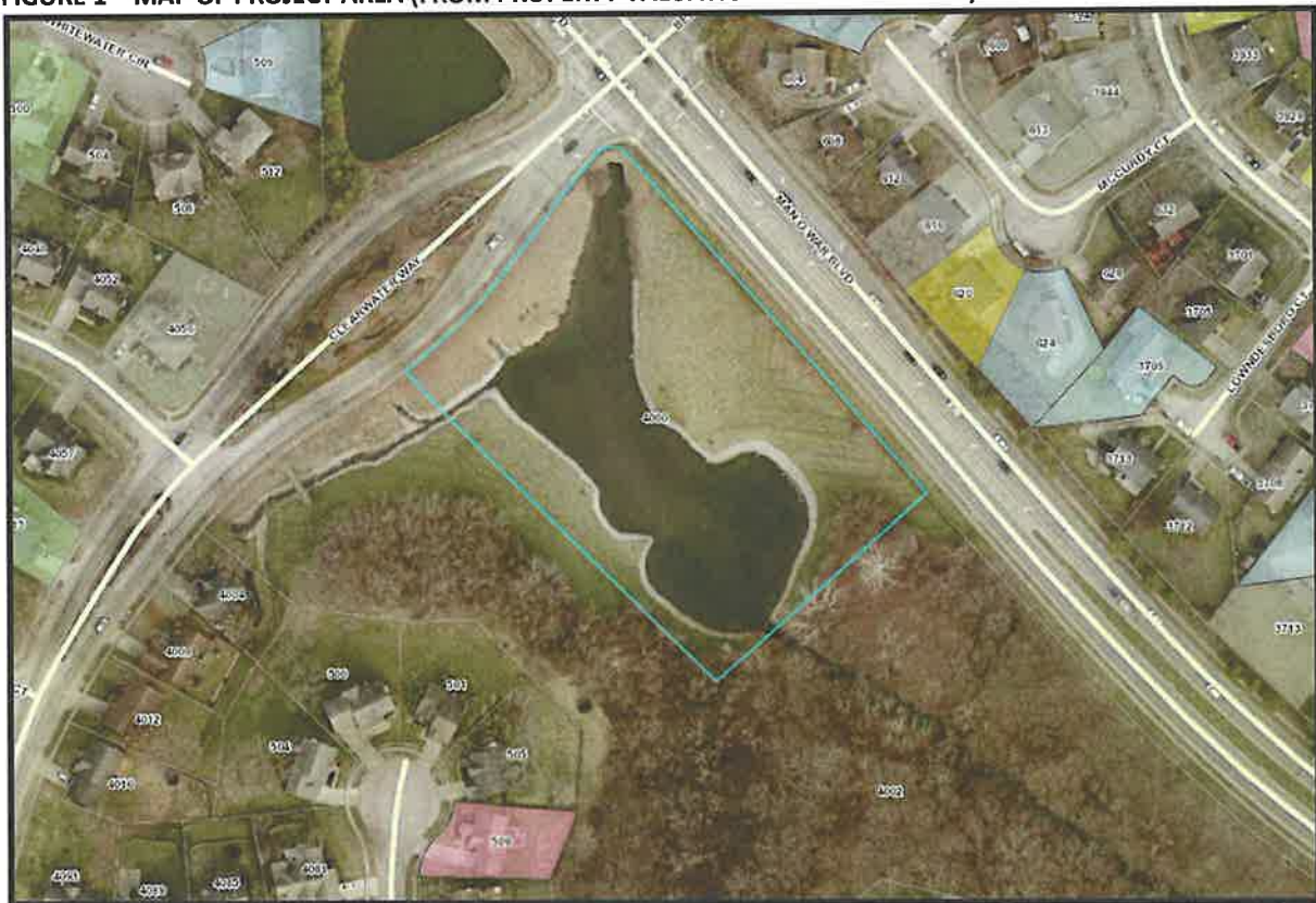
FIGURE 1 – MAP OF PROJECT AREA (FROM PROPERTY VALUATION ADMINISTRATOR)