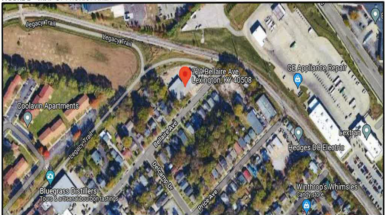
FIGURE 1 – MAP OF PROJECT AREA