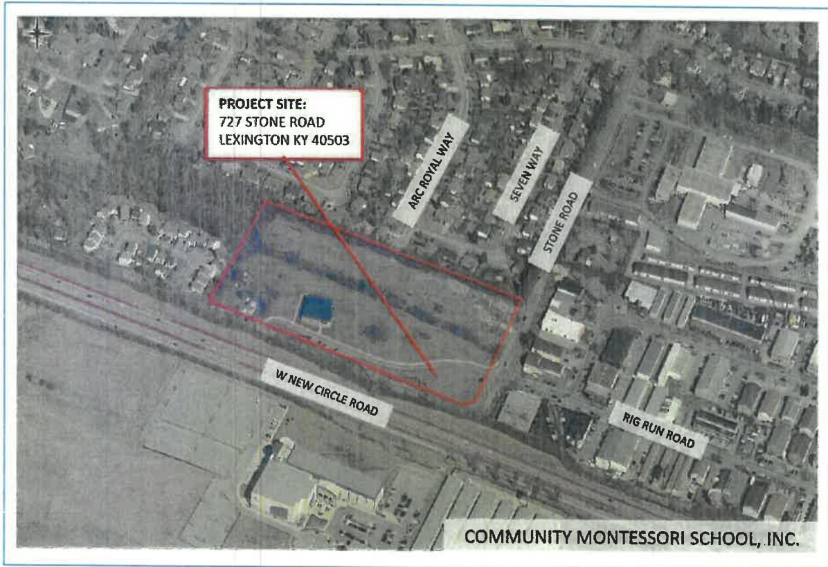
FIGURE 1 – MAP OF PROJECT AREA (FROM ARC GIS)