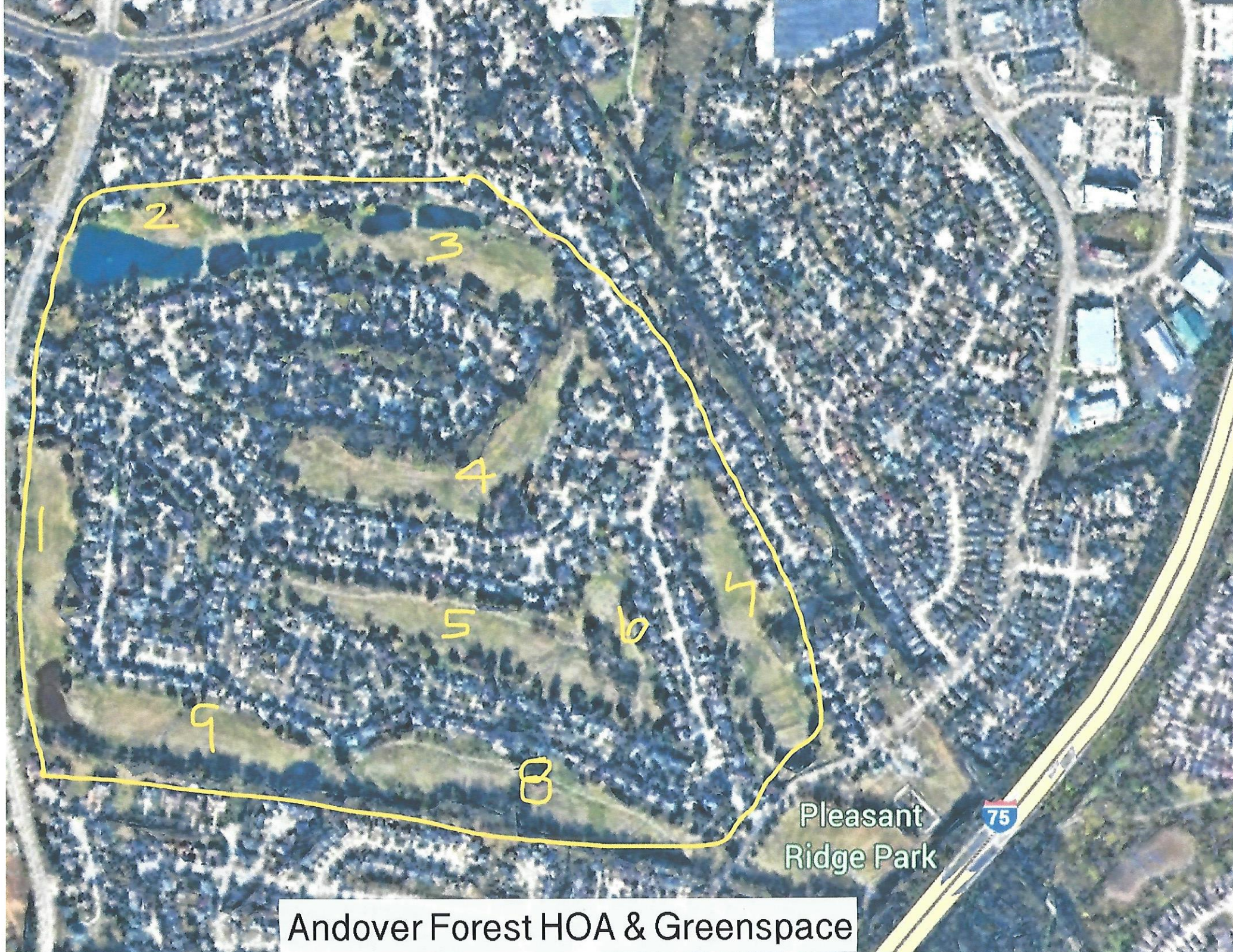
Andover Forest HOA & Greenspace