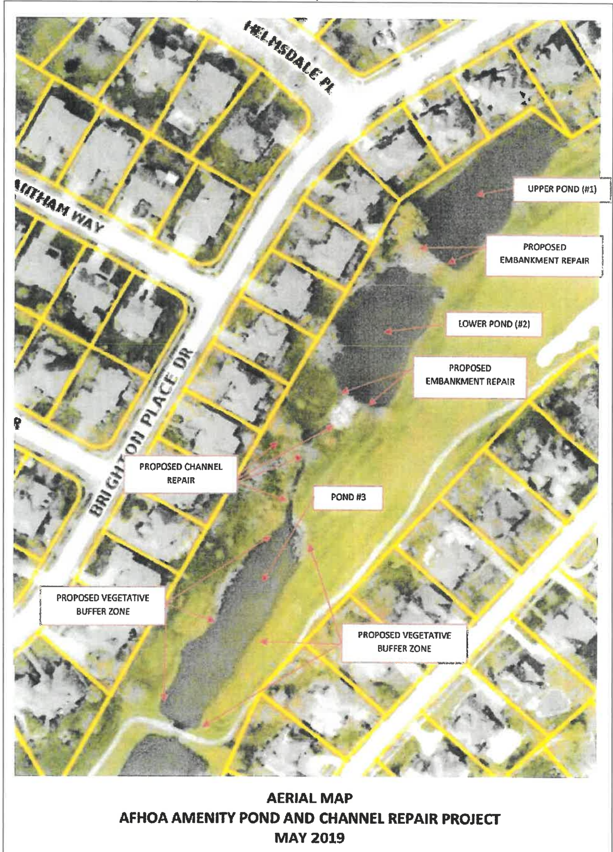
FIGURE 1 – AFHOA AERIAL MAP (FROM APPLICATION)