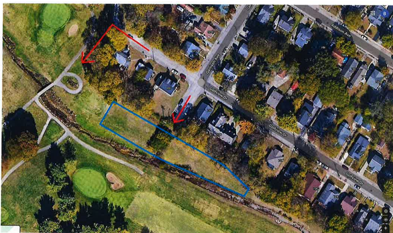
Figure S-2: Proposed Location of the constructed wetland and stream improvement at Picadoma Golf Course.