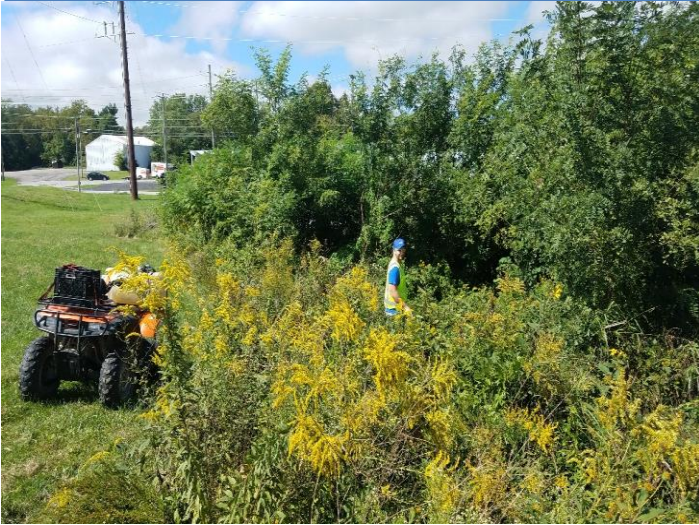
Herbicide application with ATV sprayer