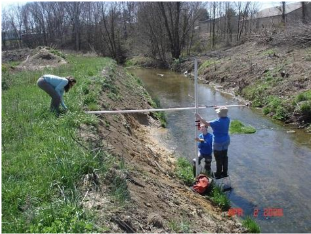
Rain Storm evaluate unstable bank conditions on Whitely Branch