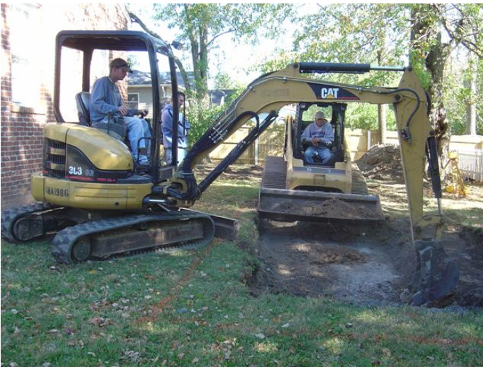
Excavation of Soil and Ash at Women's Club Site