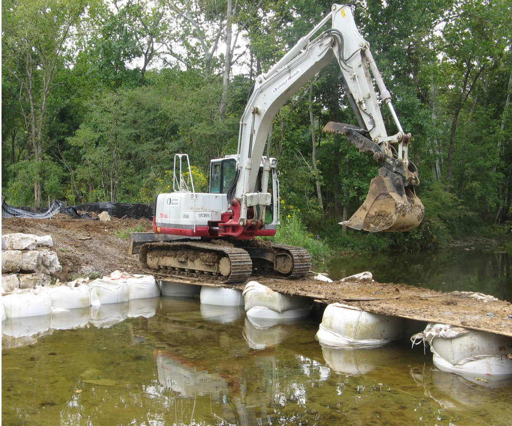
Innovative Stream Crossing Installed by Third Rock