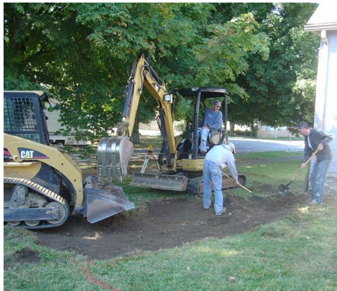
Excavation, Shockley Site