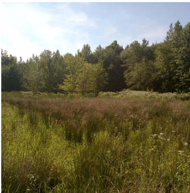
Successful emergent wetland restoration within the 80-acre site.