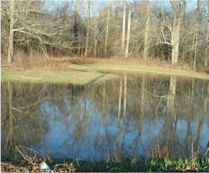
Stormwater Storage Shortly After a Rain Event