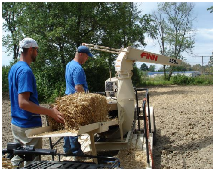
Application of Site-Specific Native Seed and Straw Mulch