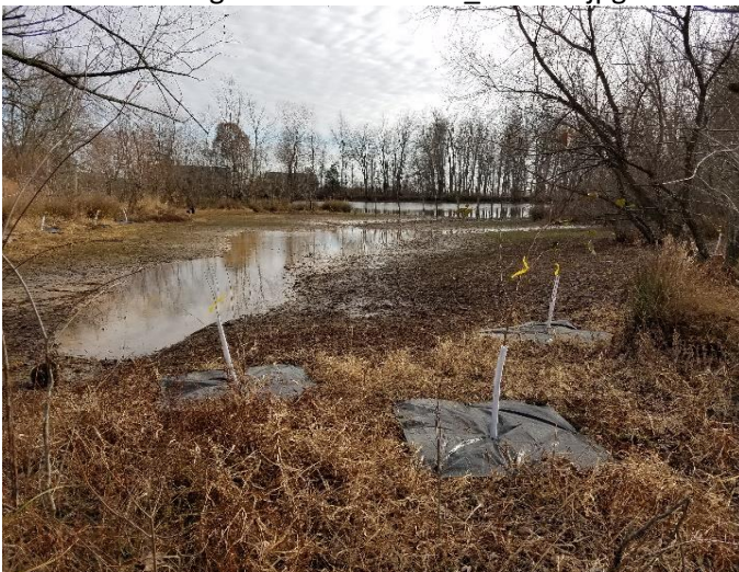
Photo Station 5 - Completed Plantings along Pond Edge 20161207_150844.jpg