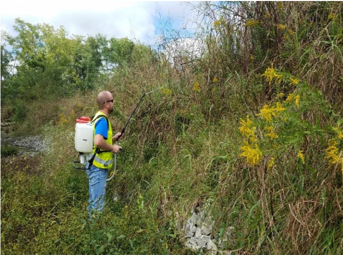
Herbicide application with backpack sprayer