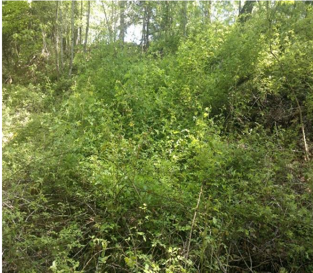
Multiflora rose before herbicide application