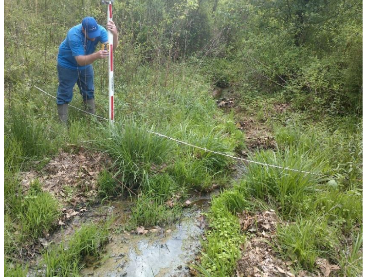
Casey Mattingly gathering data along Tributary #2