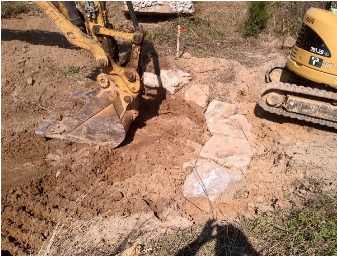
Rock step structure installation, Tributary #2