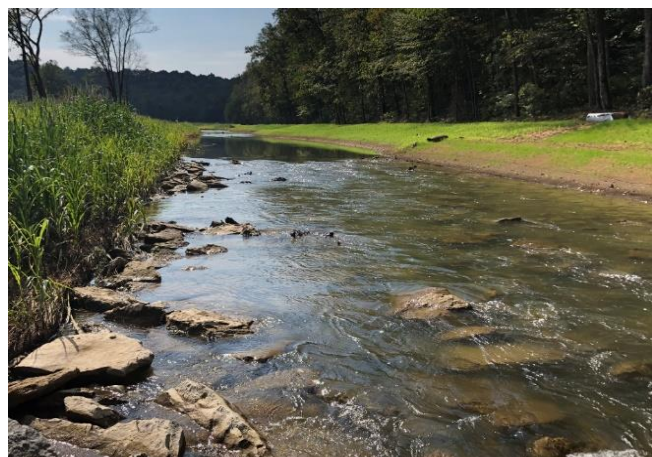
Stable constructed riffle, Goose Creek,