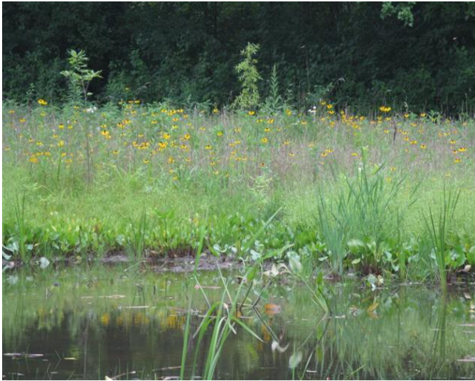
Native Wildflower Meadow Provides Upland Buffer