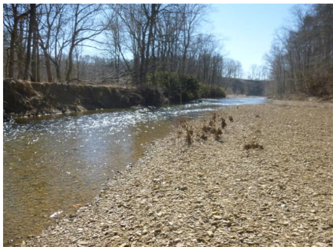
Pre-restoration view (upstream) of highly eroded, unstable bank and overwidened Goose Creek