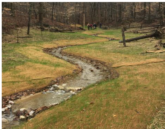
Stable tributary pattern with habitat/grade control