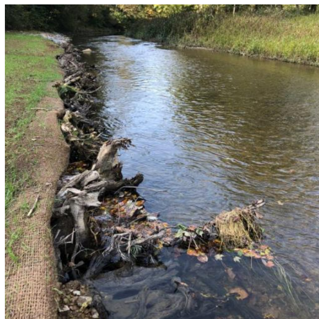
Rootwad bank habitat, Goose Creek,