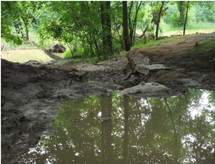
Constructed Stormwater BMP