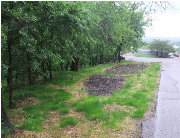
Constructed Rain Gardens