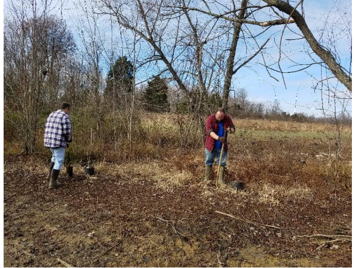
Photo Station 2 - Planting Trees along Pond's Edge 20161207_121114.jpg