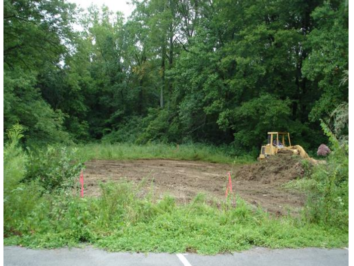
Excavation of Stormwater Wetland