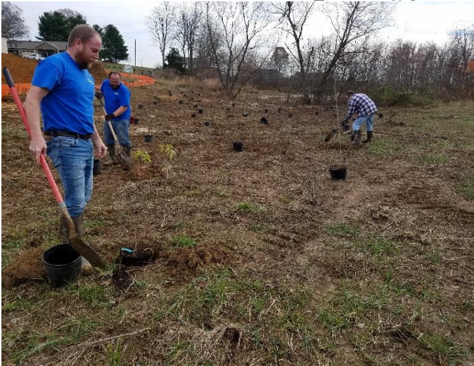
Photo Station 3 - Planting Trees within Drainage Swale 20161207_125322.jpg