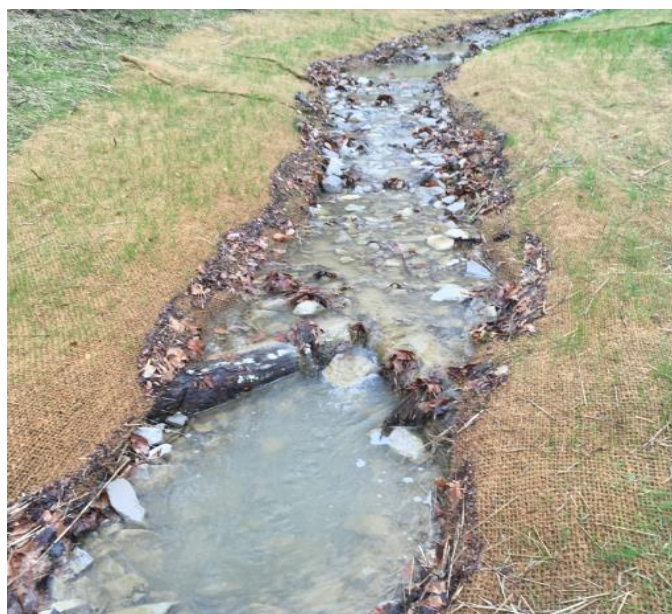
Stable tributary with habitat/grade control structures,