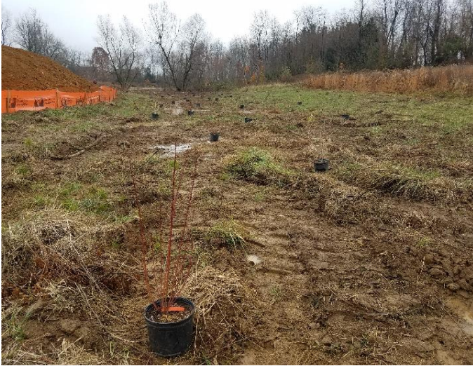
Photo Station 1 - Trees Located in Drainage Swale Prior to Installation 20161206_152633.jpg