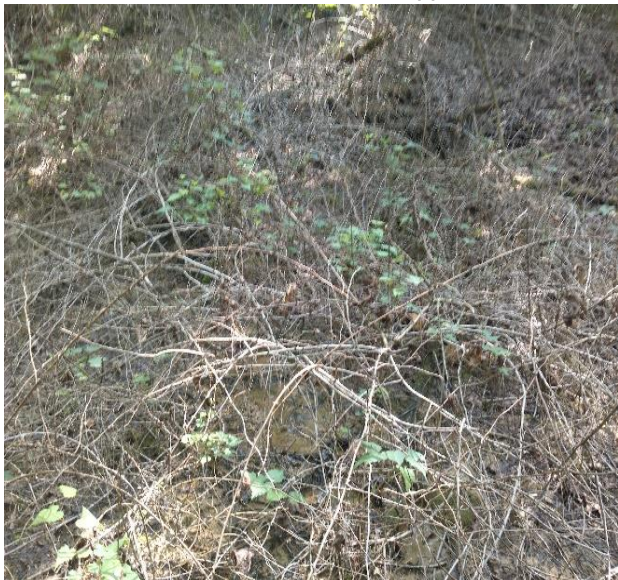
Multiflora rose after herbicide application