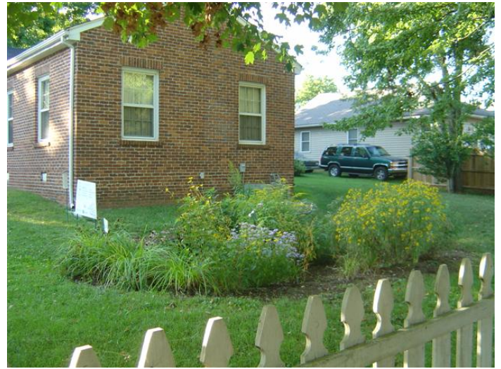
Women's Club Rain Garden, September 2009