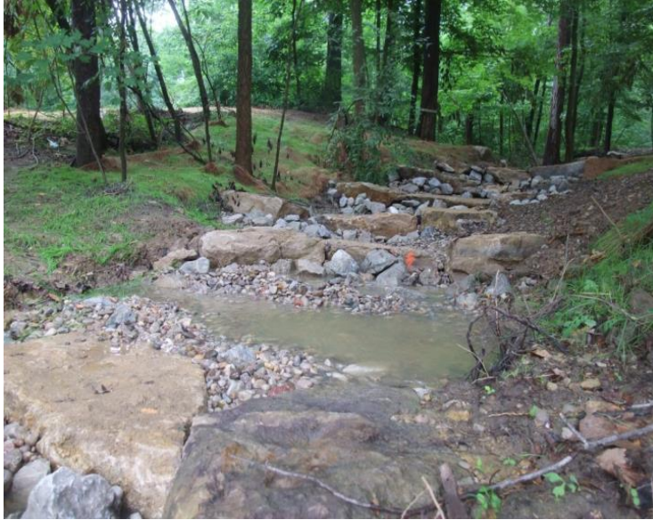
Constructed Step Pool Sequence