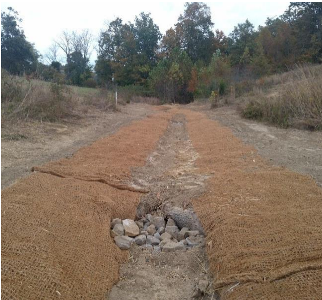
Newly constructed channel with X-Weir and coir blanket bank protection – plantings to follow in December