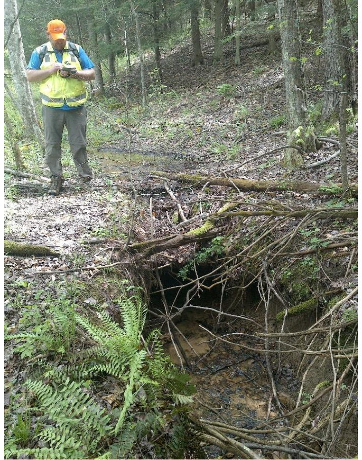
Casey Mattingly assessing existing site conditions