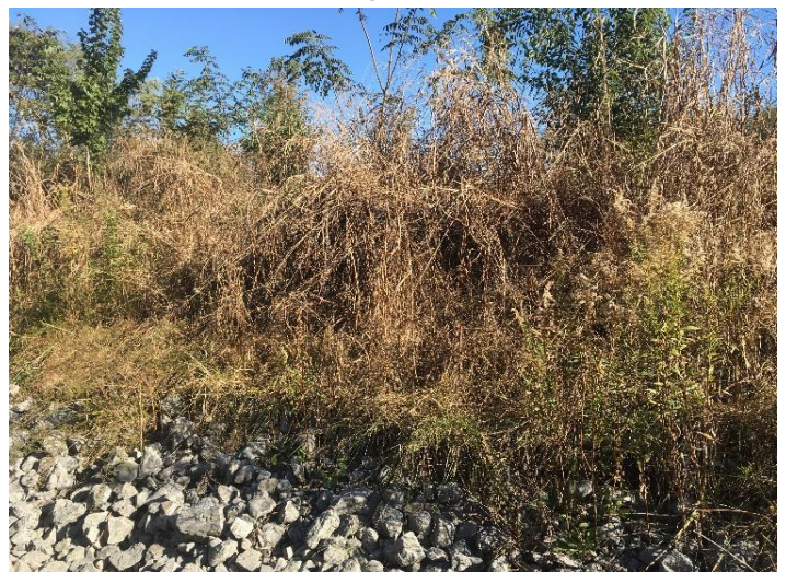
Johnsongrass post herbicide treatment