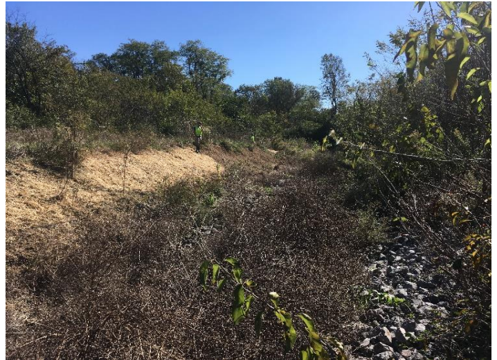
Left descending bank post herbicide application and re-seeding; south of culvert