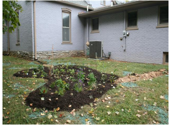
Plantings Installed, Shockley Site