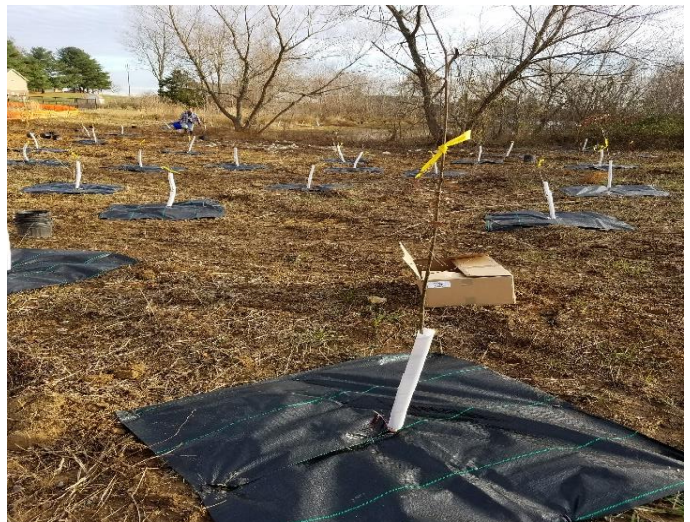
Photo Station 6 - Completed Planting within Drainage Swale 20161207_152637.jpg