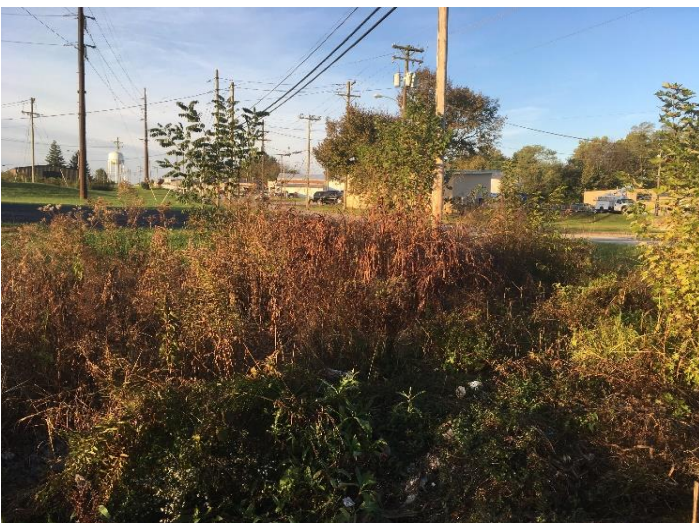
Evidence of select control on targeted species; post herbicide application