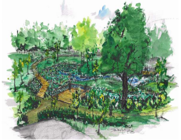
Conceptual Design / Rendering of Stormwater Wetland