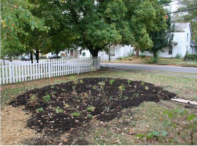
Planted Rain Garden, Women's Club Site