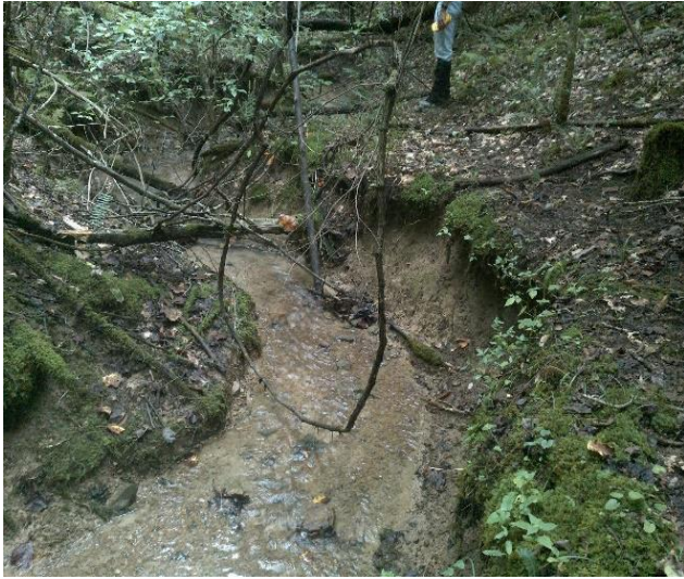
Eroding bank prior to restoration