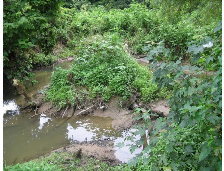
Whitely Branch with eroding banks and mid-channel bar before restoration