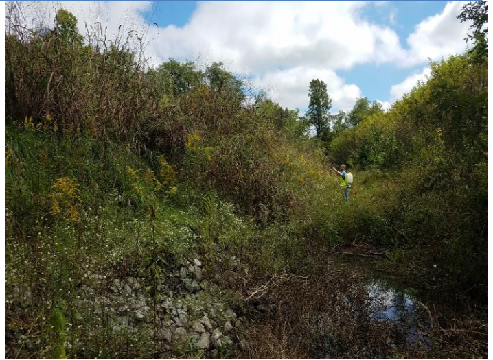
Herbicide application on left descending bank south of culvert