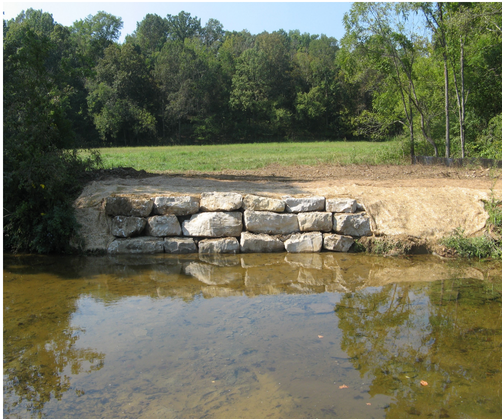
Completed Bank Stabilization