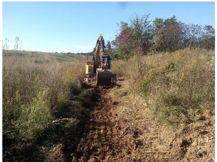
Initial grading of Tributary #1 channel