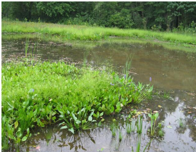
Emergent Wetland Vegetation Provides Stormwater Treatment