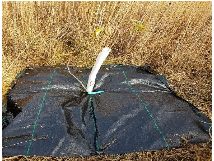
Photo Station 4 - Tree with PVC Wrap and Weed Barrier 20161207_142753.jpg