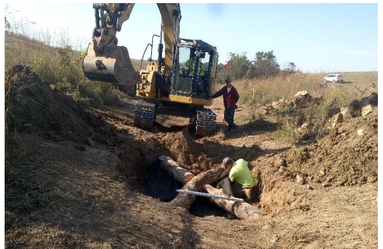
X-Weir structure installation