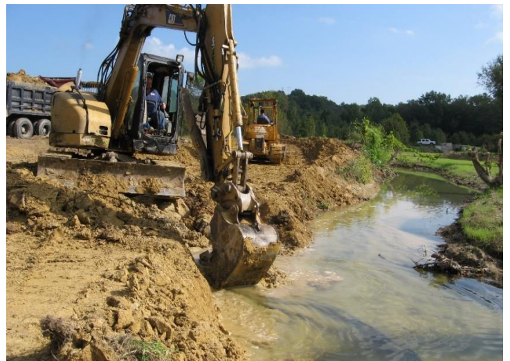
Town Branch – altered with little in-stream habitat adjacent to London's waste transfer and recycling station