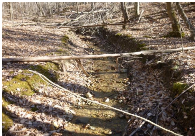
Pre-restoration view (upstream) of typical degraded tributary with downcutting & overwidening