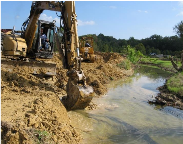
City personnel installing a habitat log structure under Third Rock supervision