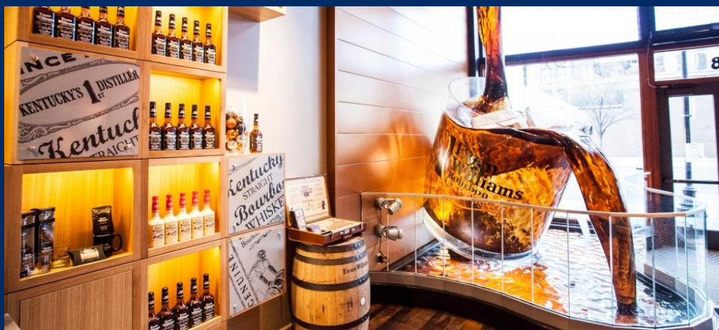
Evan Williams Experience (Louisville, KY)