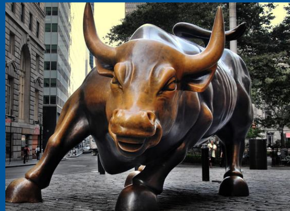
Charging Bull (New York, NY)