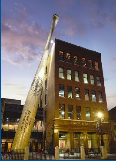
Louisville Slugger Bat (Louisville, KY)