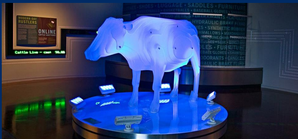
Cattle Raisers Museum (Fort Worth, TX)