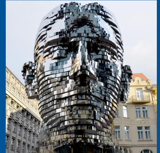
Head of Franz Kafka (Prague, Czech Republic)