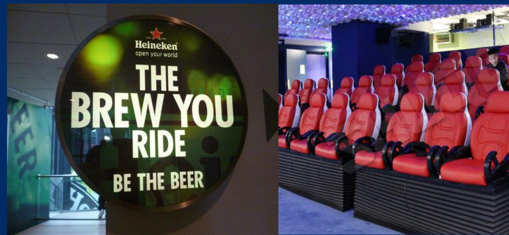
The Brew You Ride (Amsterdam, Netherlands)