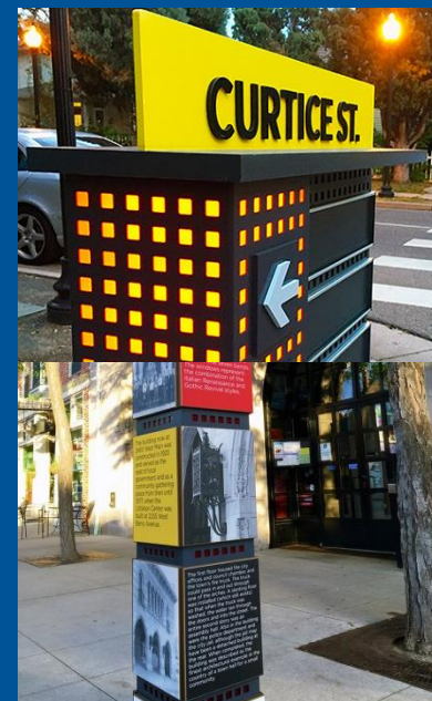
Informational: Littleton, CO