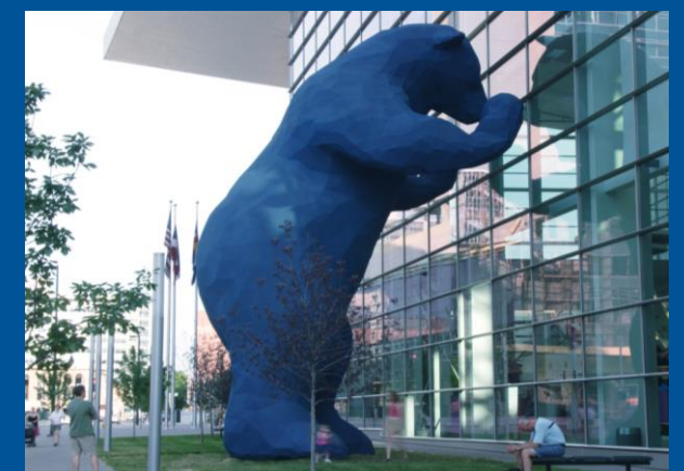
I See What You Mean (Denver, CO)