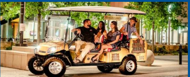
Joyride (Knoxville, Panama City, Nashville, Tuscaloosa, Tallahassee)