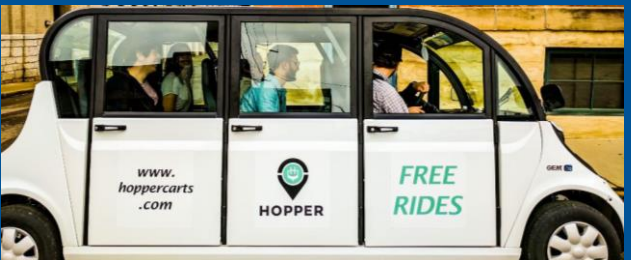
Hopper Carts (Columbus, OH)