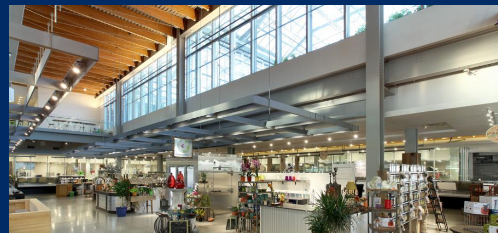
Downtown Market (Grand Rapids, MI)