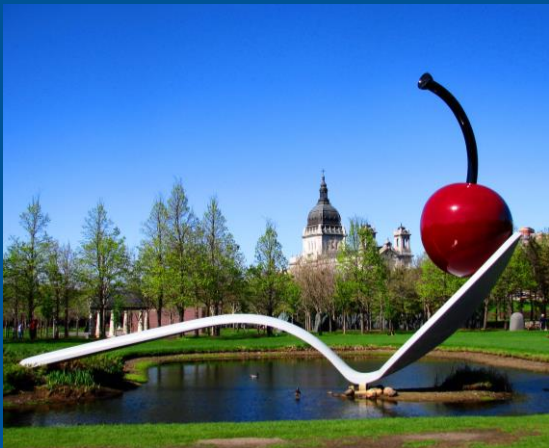
Spoon Bridge (Minneapolis, MN)