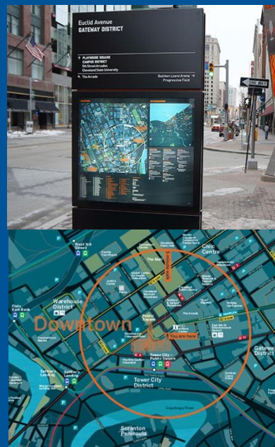
Seamless Cleveland: Cleveland, OH