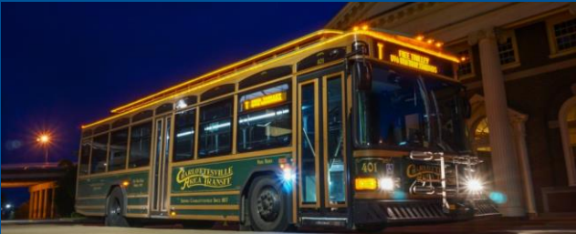
Free Trolley (Charlottesville, VA)