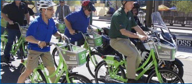
GR:D Bikeshare (Tempe, AZ)