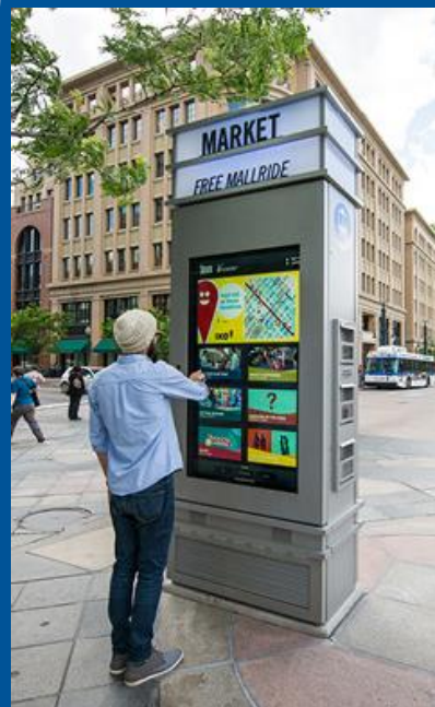
Interactive Kiosk: Denver, CO