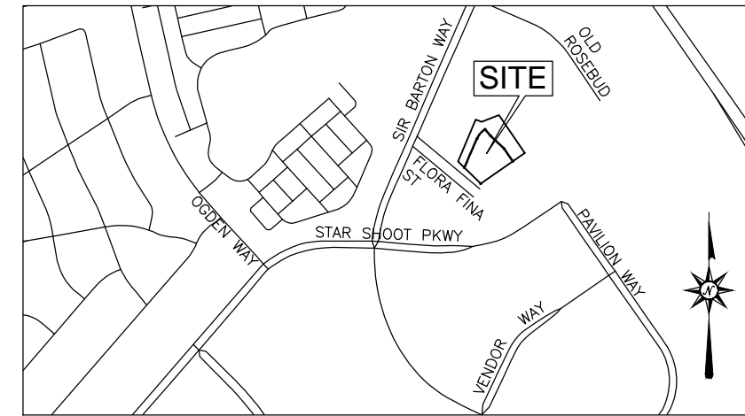
VICINITY MAP N.T.S.