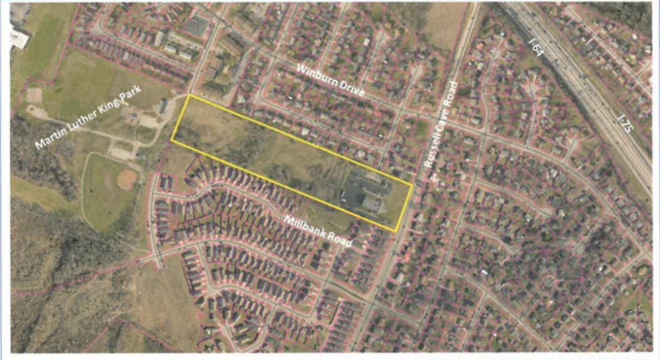
FIGURE 1 – MAP OF PROJECT AREA (FROM GIS)

Note: The subject property is located within the Cane Run Watershed.