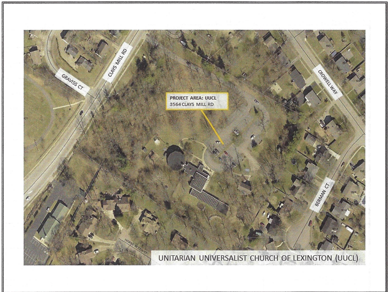
FIGURE 1 – MAP OF PROJECT AREA (FROM APPLICATION)