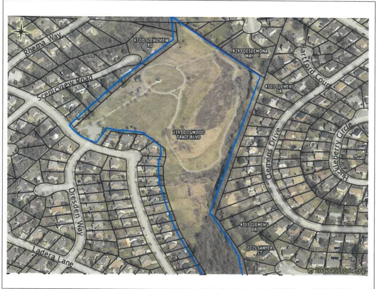
FIGURE 1 – 2018 PICTOMETRY IMAGE AT 2393 DOGWOOD TRACE BLVD