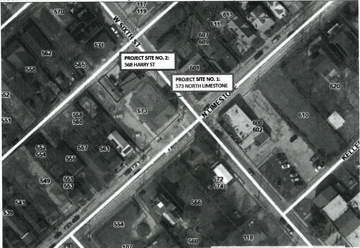
FIGURE 1 – MAP OF PROJECT SITES NO. 1 (573 NORTH LIMESTONE) & NO. 2 (568 HARRY STREET)