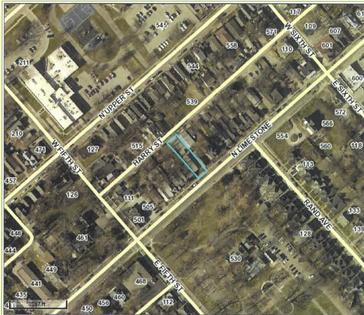
FIGURE 1 – MAP OF PROJECT AREA