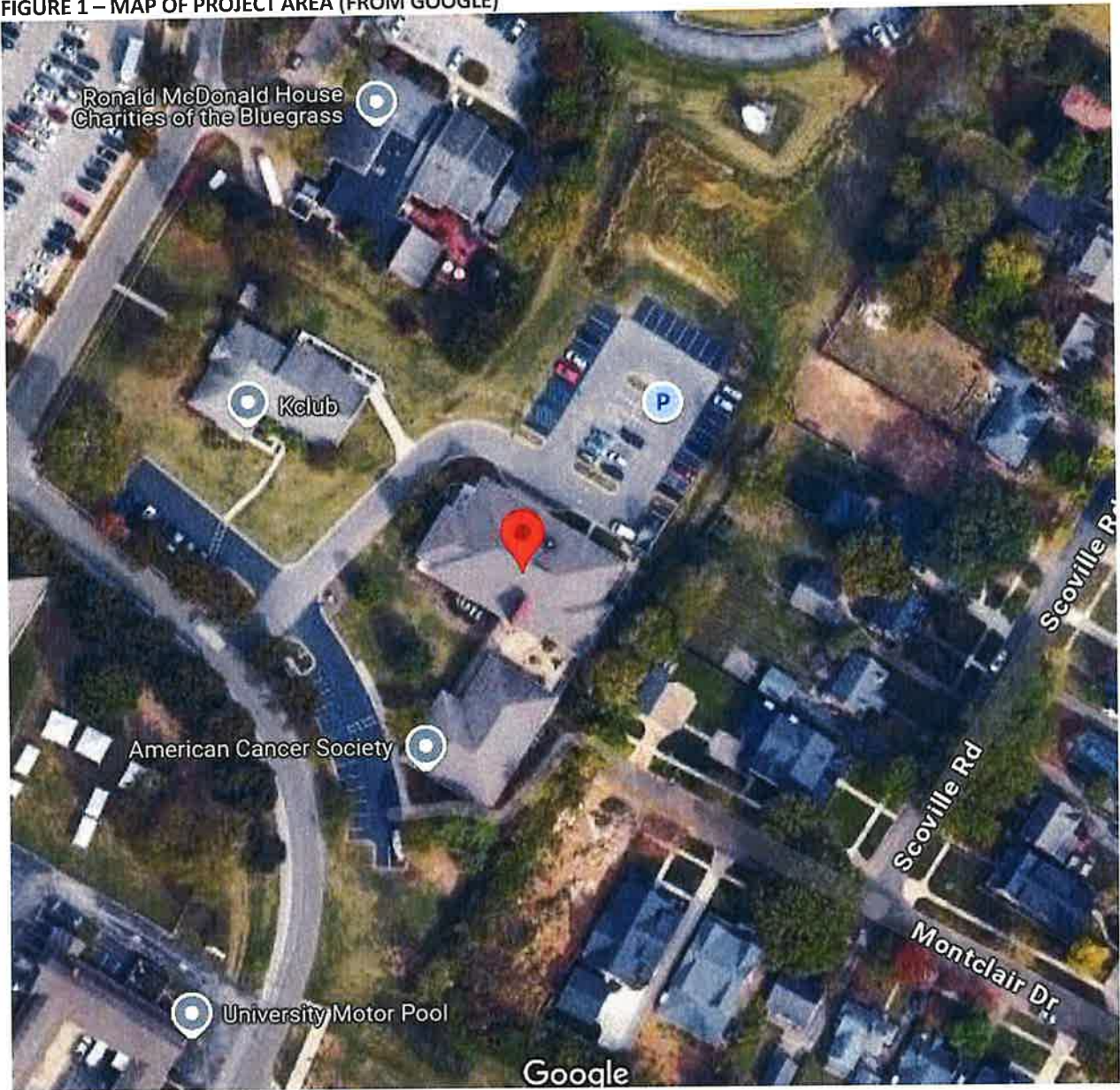
FIGURE 1 – MAP OF PROJECT AREA (FROM GOOGLE)