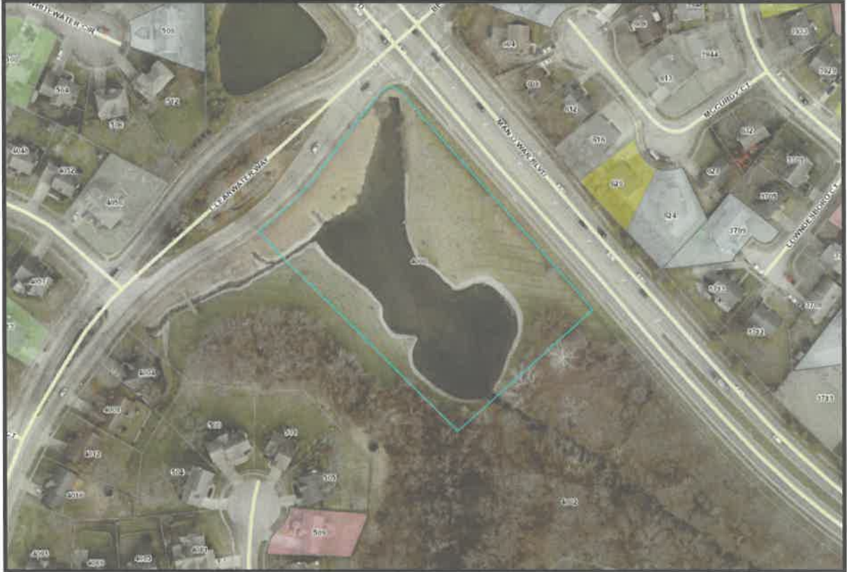
FIGURE 1 – MAP OF PROJECT AREA (FROM PROPERTY VALUATION ADMINISTRATOR)