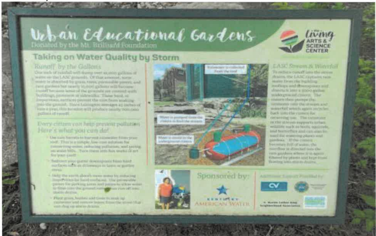
FIGURE 1 – AN EXAMPLE OF SIGNAGE REGARDING BMPs IN THE LASC EDUCATIONAL GREEN SPACE (FROM APPLICATION)