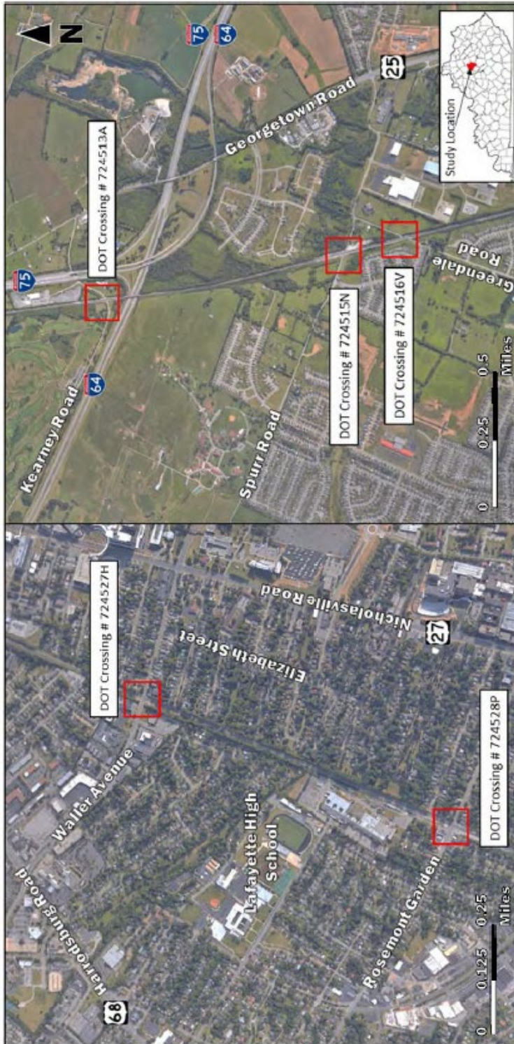
Figure 1: Study Highway-Rail Grade Crossing Locations

Study Map along the Norfolk Southern Rail Line: