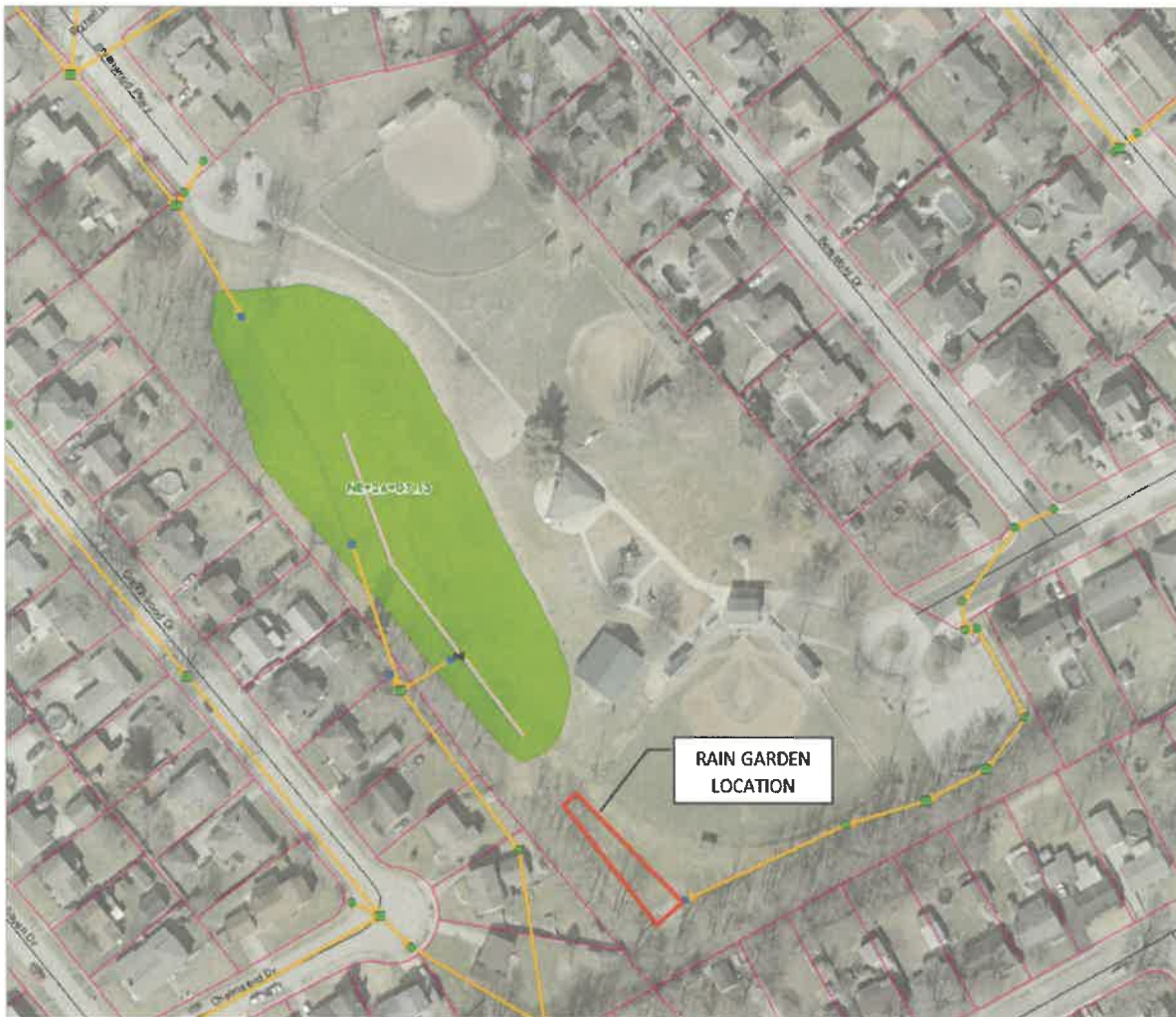
FIGURE 1 – MAP OF PROJECT AREA AT 612 BRYANWOOD PARKWAY (FROM PROPERTY VALUATION ADMINISTRATOR)