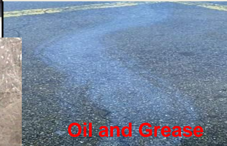
Oil and Grease