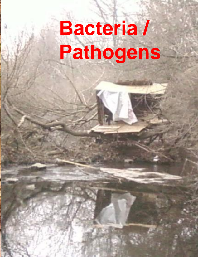
Bacteria / Pathogens