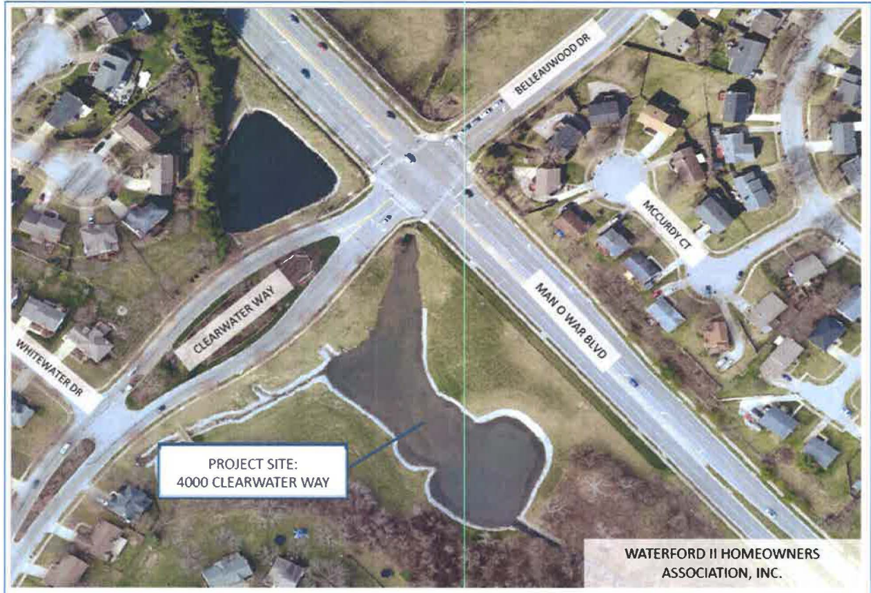
FIGURE 1 – FEASIBILITY STUDY AREA