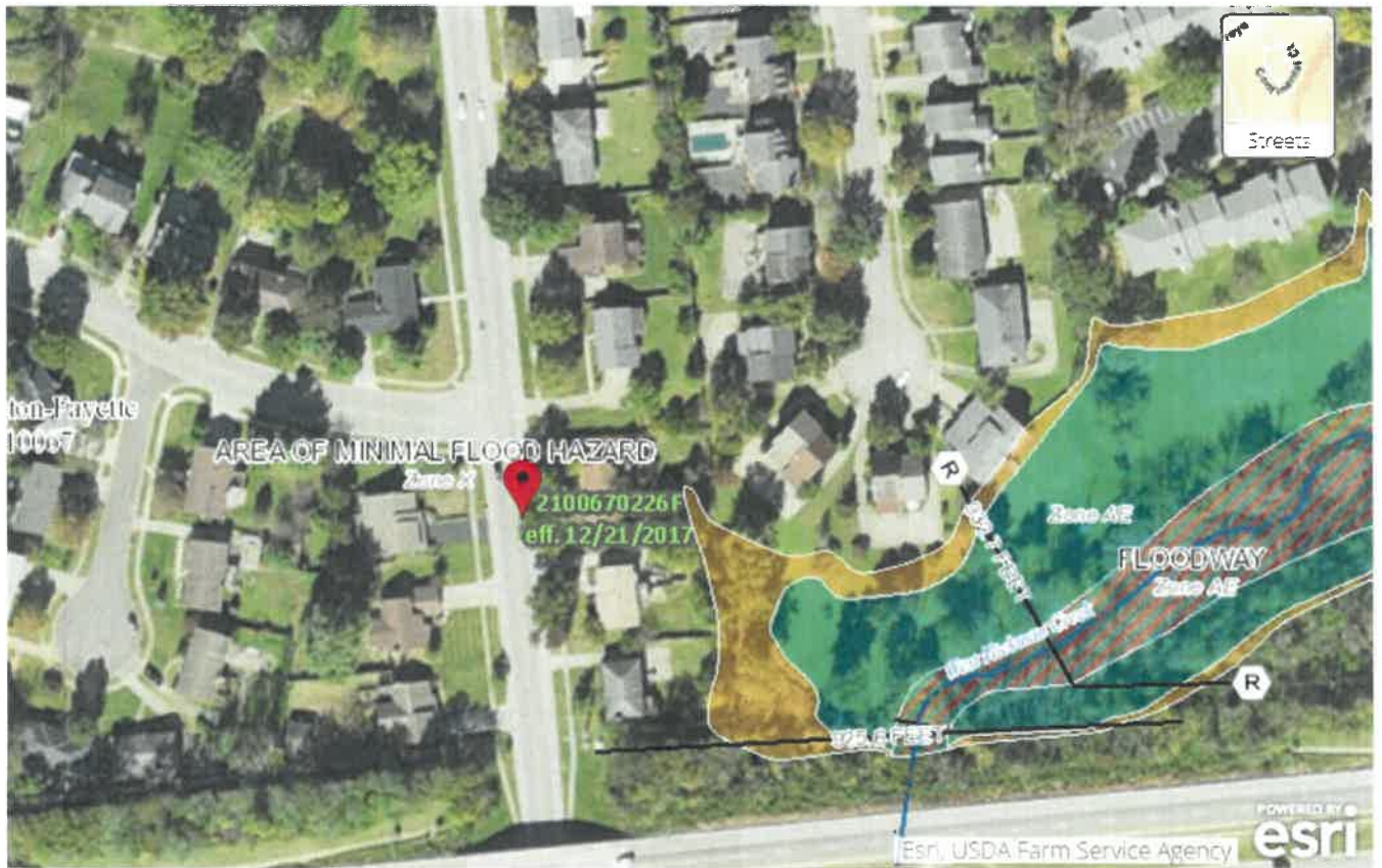
FIGURE 1 – FLOODWAY MAP (FROM APPLICATION)