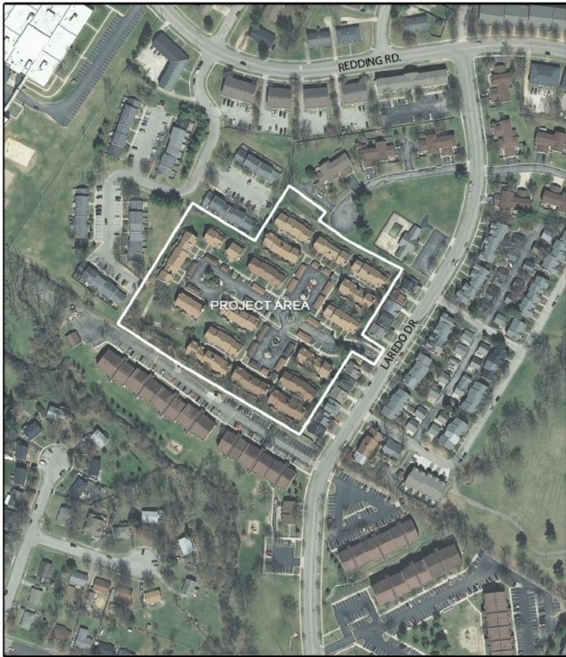
FIGURE 2 – PROJECT AREA OF ASHWOOD TOWNHOUSES OF LAREDO WATER QUALITY INCENTIVE GRANT

ASHWOOD TOWNHOUSES OF LAREDO WATER QUALITY INCENTIVE GRANT