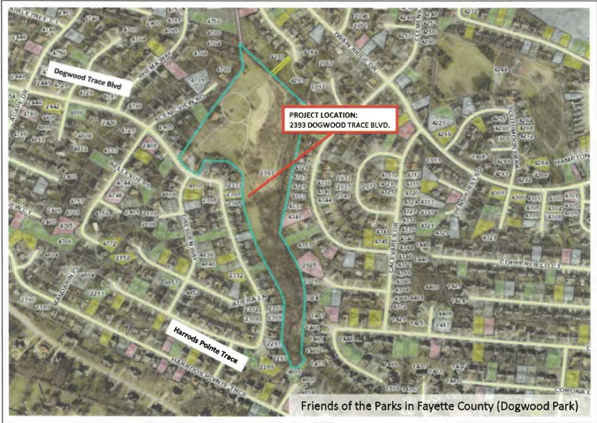
FIGURE 1 – MAP OF PROJECT AREA (FROM PVA)