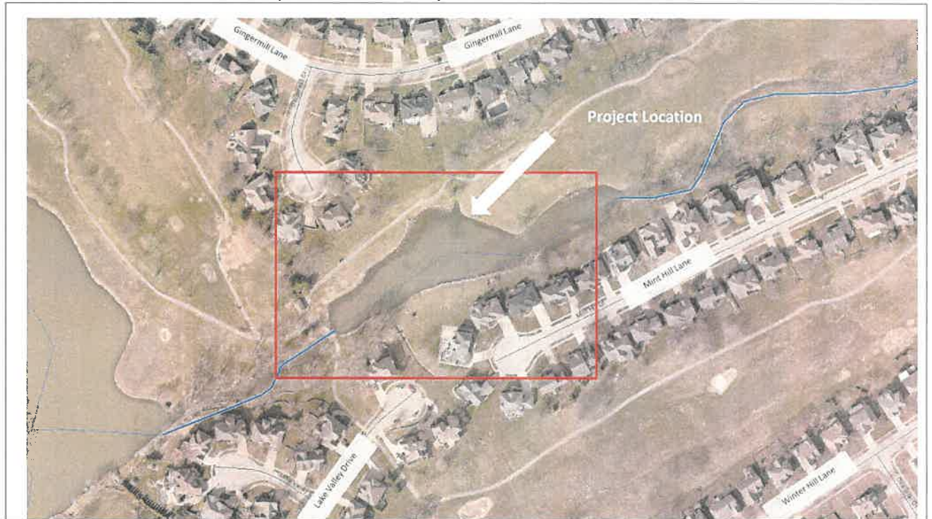
FIGURE 1 – MAP OF PROJECT AREA (FROM APPLICATION)