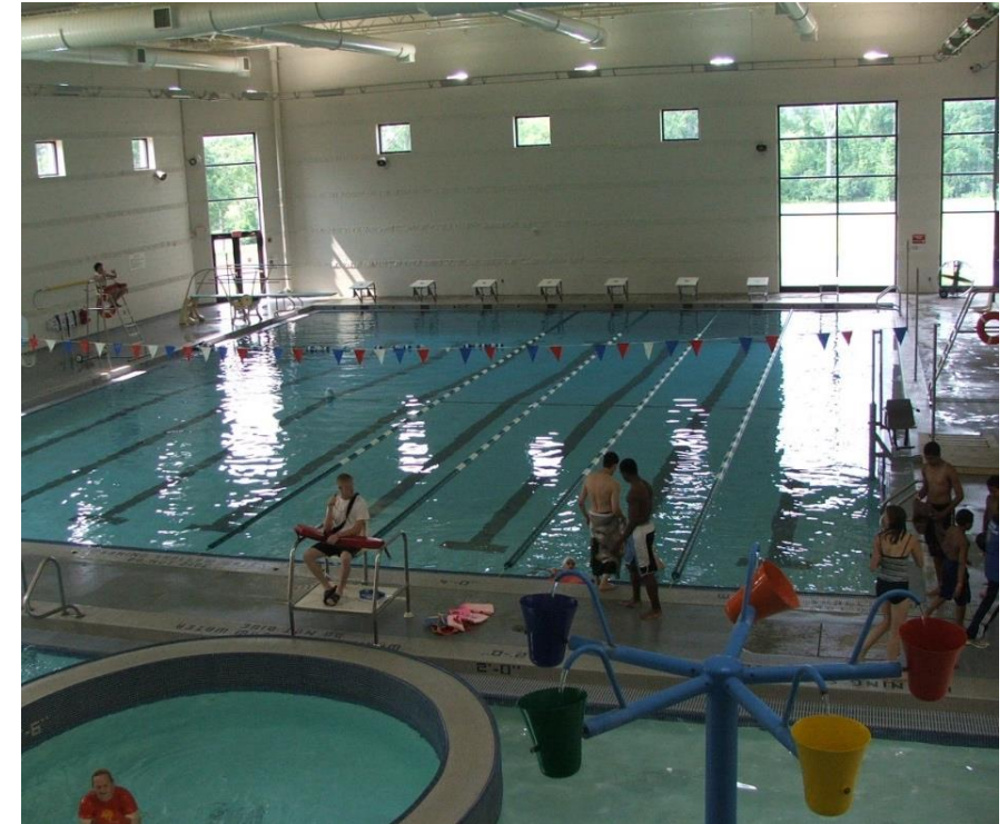
Indoor Family Aquatics Center- Georgetown, KY