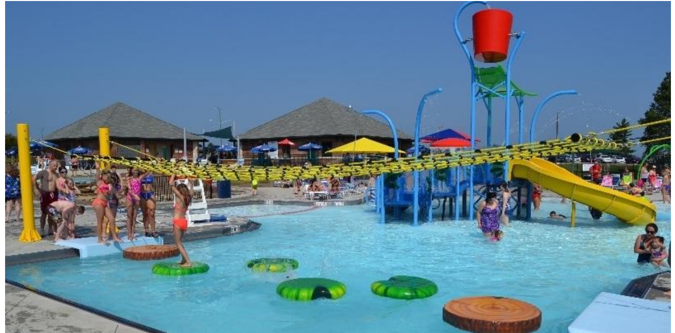
Regional Family Aquatic Center